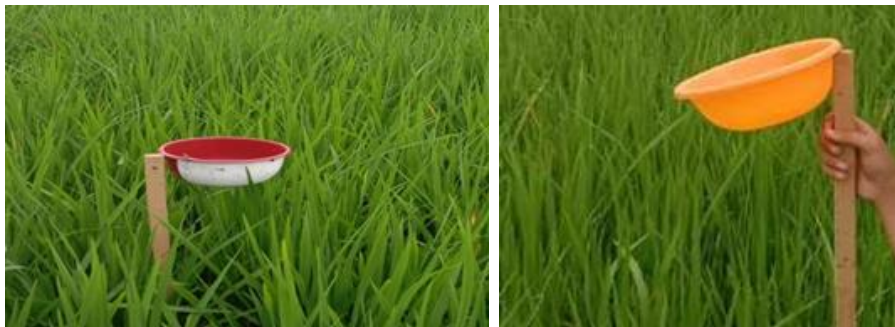
Figure 7. Color Pan Trap (CPT) for controlling rice pests