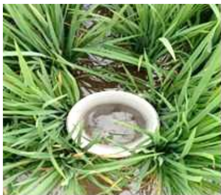
Figure 3. Core sampler (CS) (Personal documentation, 2022).

In contrast, the Yellow Sticky Trap (YST) shown in Figure 2 consists of yellow paper covered with sticky glue to capture insects, measuring into sizes of 25 cm x 20 cm (as depicted in Figure 2). It is set up in the morning, from 08.00 to 09.00 am, with weekly monitoring intervals and a total of 8 observations throughout the rice planting period. The insects caught are gathered in sample containers, examined in a laboratory setting, and tallied for the purpose of data analysis.