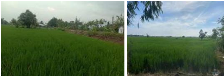
Figure 6. Research location in Serbajadi Village