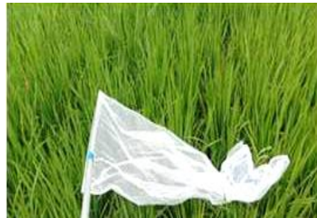
Figure 1. Sweep Net (SN)

The Sweep Net (depicted in Figure 1) is constructed from lightweight and sturdy mesh, allowing for easy handling to ensure that captured insects are visible. Ten swings of the net are performed at every sampling location. Insect collection takes place in the morning, between 08:00 and 10:00am. The insects captured are subsequently gathered and placed in sample bottles for the purpose of identification and the calculation of their population and biological indices.