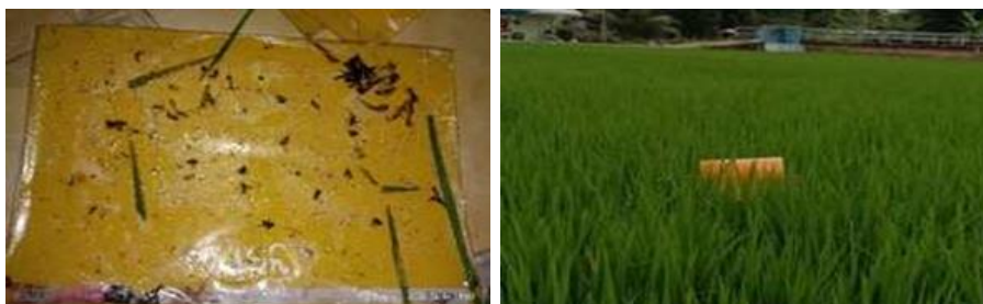
Figure 8. Insects trapped with Yellow Sticky Trap (YST)