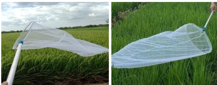
Figure 9. Use of Sweep Nets (SN) to catch pests in rice fields