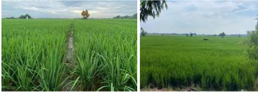
Figure 5. Rice fields in Serbajadi Village