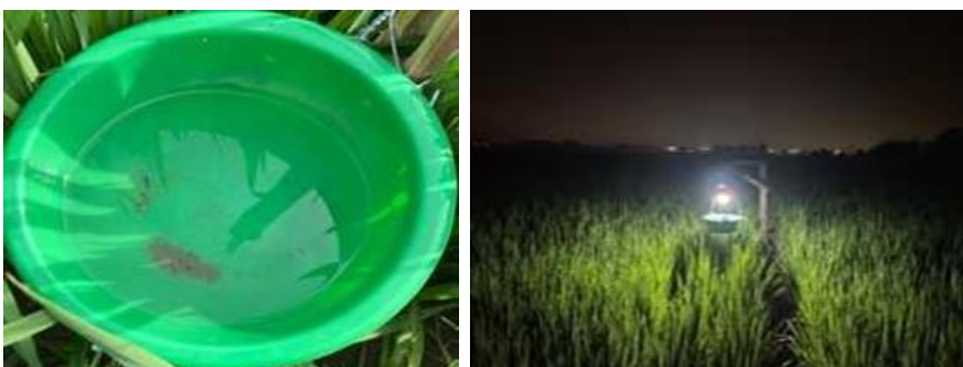
Figure 11. Colour Pan Trap (CPT) and Light Trap (LT) traps.

The outcomes of the research carried out in Serbajadi Village, Sunggal District, North Sumatera, have shown that the application of agrochemical inputs, particularly pesticides and fertilizers, has resulted in adverse environmental and social effects. According to Siregar et.al., [21] and Orr [22] the findings, monitoring rice plant insects prior to planting and utilizing the CPT for insect collection can be a means to decrease pesticide usage and