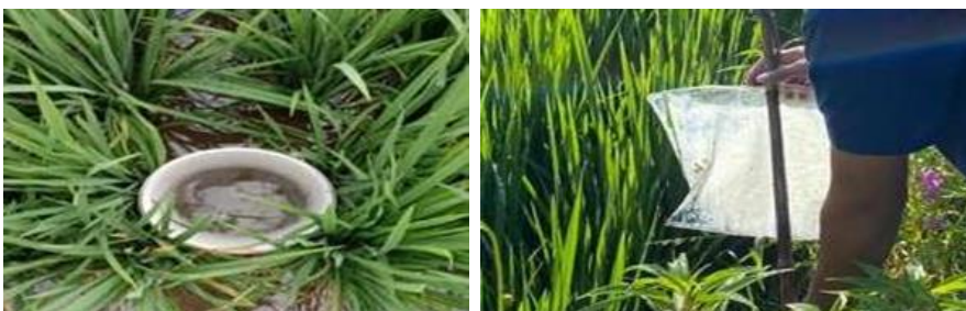
Figure 10. Core Sampler and collected into plastic