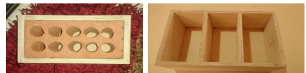
Figure 7. Molding plywood structure

The role of sand is to reduce the volumetric changes of the brick and therefore cracking. Water is added to give plasticity to the mix, at 15% of the mix weight. The clay brick forms are made of plywood with dimensions of 19.7 × 12.3 × 9.5 cm as shown in figure 7.