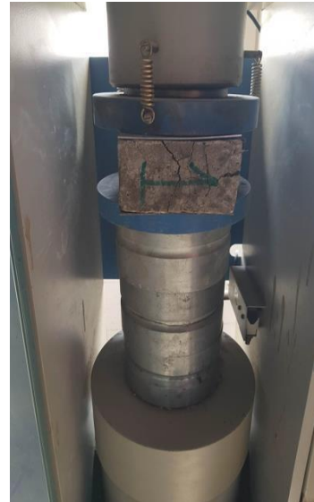
Figure 9. Samples Crushing load

determined using a compression machine under a loading rate of 0.2 MPa/sec as shown in figure 9.