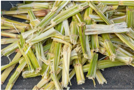
Figure 1. Sugarcane wastes

These applications show that the use of sugarcane bagasse may represent economic and environmental importance for the sugarcane producing countries [11].