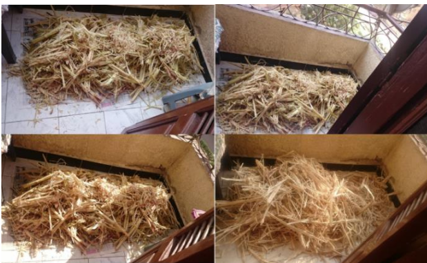
Figure 5. Drying the bagasse using the sunlight

Then, drying takes place by exposing it to direct sunlight for 15 days, as shown in figure 5. To ensure complete drying, the SCB is frequently weighed until reaching a constant weight.