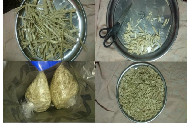
Figure 6. Cutting dried SCB

The dried SCB are fragile fibres and have a light unit weight of 0.09 kg/m 3 . The fibre diameter ranges from 0.3 to 1.2 mm. Then the dried fibres are cut manually to an 80 mm length as shown in figure 6.