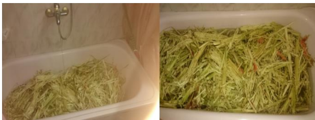
Figure 4. Washing of SCB

The treatment regimen starts with soaking it in hot water at 90 °C for five days, with water changed every day to extract the remaining sugar out of it, Figure 4.