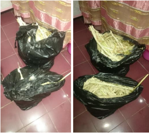
Figure 3. Collected SCB

The treatment regimen starts with soaking it in hot water at 90 °C for five days, with water changed every day to extract the remaining sugar out of it, Figure 4.