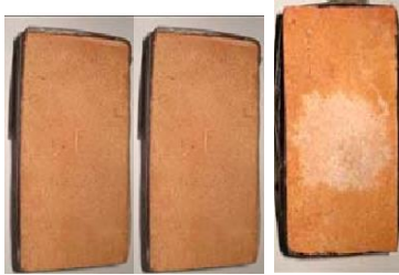
Figure 8. Brick samples

The burned specimens are moved from the brick manufacturing plant to the laboratory to conduct the experimental programme as shown in figure 8.