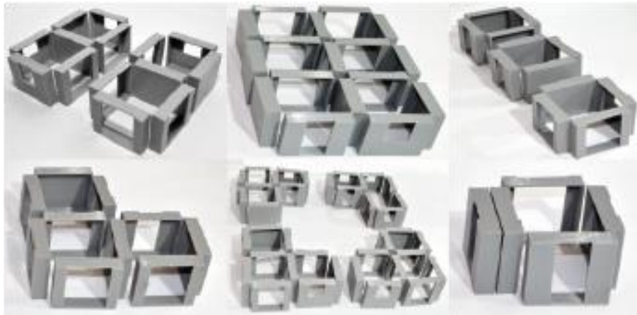
Figure 2. Type of manufactured home