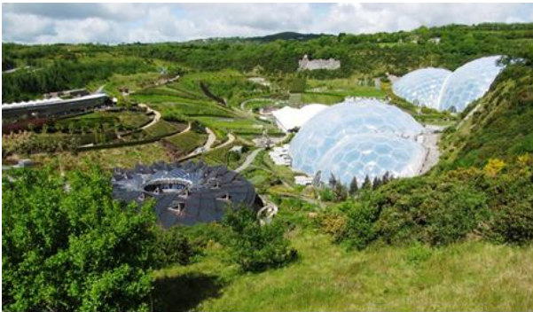
Figure 2. A view of the complex from the north-eastern slope.

The complex landscape of the area influenced the placement of objects on the site, determined their size and significance in the complex. The bionic principle of greenhouses allowed them to organically fit into the existing environment and contrast with it at the same time (Figure 2).