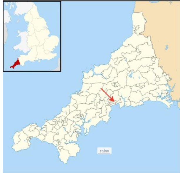
Figure 1. Territorial location of the Eden Project

Cornwall Airport Newquay is the main commercial airport in Cornwall, located 7 kilometers northeast of the city of Newquay on the northern coast of the peninsula. The distance from Eden Project to the airport is about 29 kilometers [14].