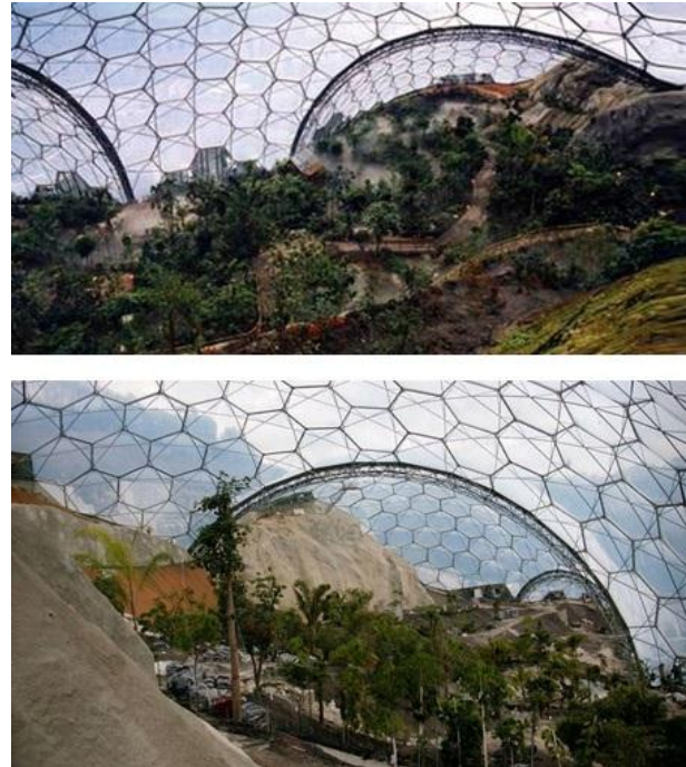
Figure 3. Internal volume of the Tropical Biome in the Eden Project.