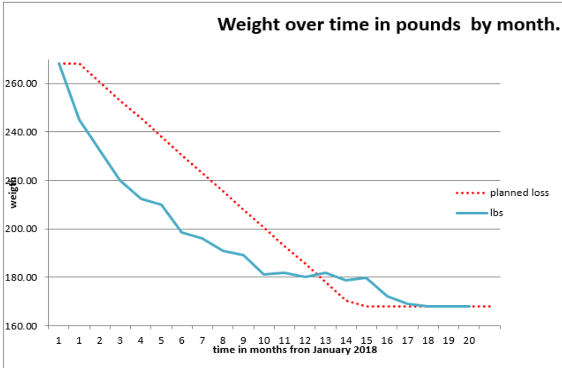
Figure 1. Weight (in pounds) over months