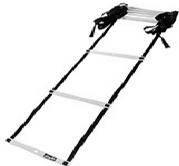
Figure 2. An exercise machine Coordination ladder to develop speed and coordination of students playing basketball

The presented machine is fixed at the top and bottom by a rope ladder with a total length of 6 m with 12 steps 4 mm thick, 36 mm wide, 500 mm long. The general technique of using this machine includes both homogeneous and different movements with changes in speed, pace, and direction. The use of the machine is based on the principle of complicating the conditions of movements with an emphasis on the development of speed and coordination of movements: the simultaneous performance of movements with different limbs on unstable support. Also, students with a high level of technical preparedness can perform movements with the ball simultaneously.