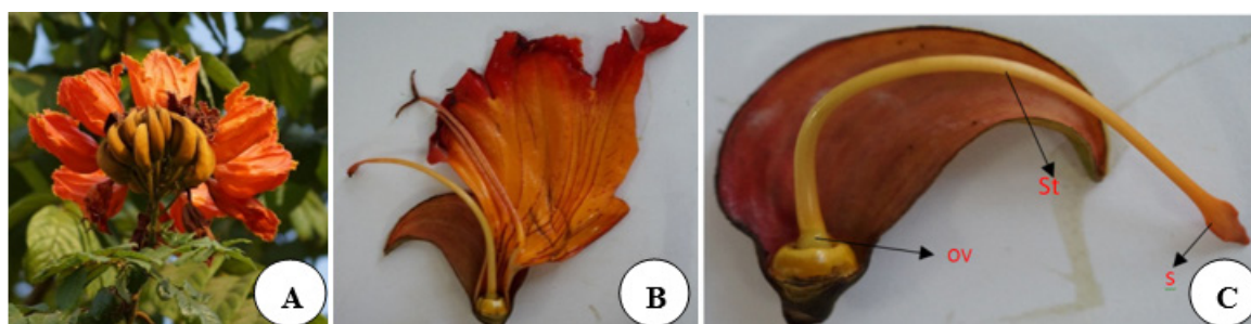
Figure 1. Spathodea companulata : A. Inflorescence with young buds and open flowers. B. Open flower showing anthers and stigma. C. Pistil with terminal style (St), bilobed and closed stigma (s) and the nectariferous disc at the base of ovary (ov)

The percentage of pollen germination and pollen tube growth was assessed in the extract of different Female Reproductive parts (FRP) respectively. An attempt made to test the effect of various concentrations of FRP extract was able to enhance the germination response and showed highest pollen tube length. Initially no germination response was achieved up to 30 min of incubation in BK medium supplemented with the extract of all female reproductive parts (FRP). However, the pollen grains responded to germination after the incubation period was extended up to 1 - 4 hours at room temperature with the same composition. Ovary extract gave the best response to germination while maximum tube growth was noticed in the extract of whole gynoecium (Table 1 and Figure 2, 3). This shows that pollen germination and tube growth regulated by all the components present in the whole gynoecium. Overall 20% and 30% BK concentration shows maximum germination in one and other selected parts of gynoecium.