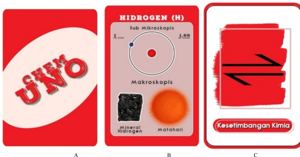
Figure 2. (A) Chemical Element Card (Rear View), (B) Chemical Element Card (Front View), (C) One of the Chemuno-Act Cards