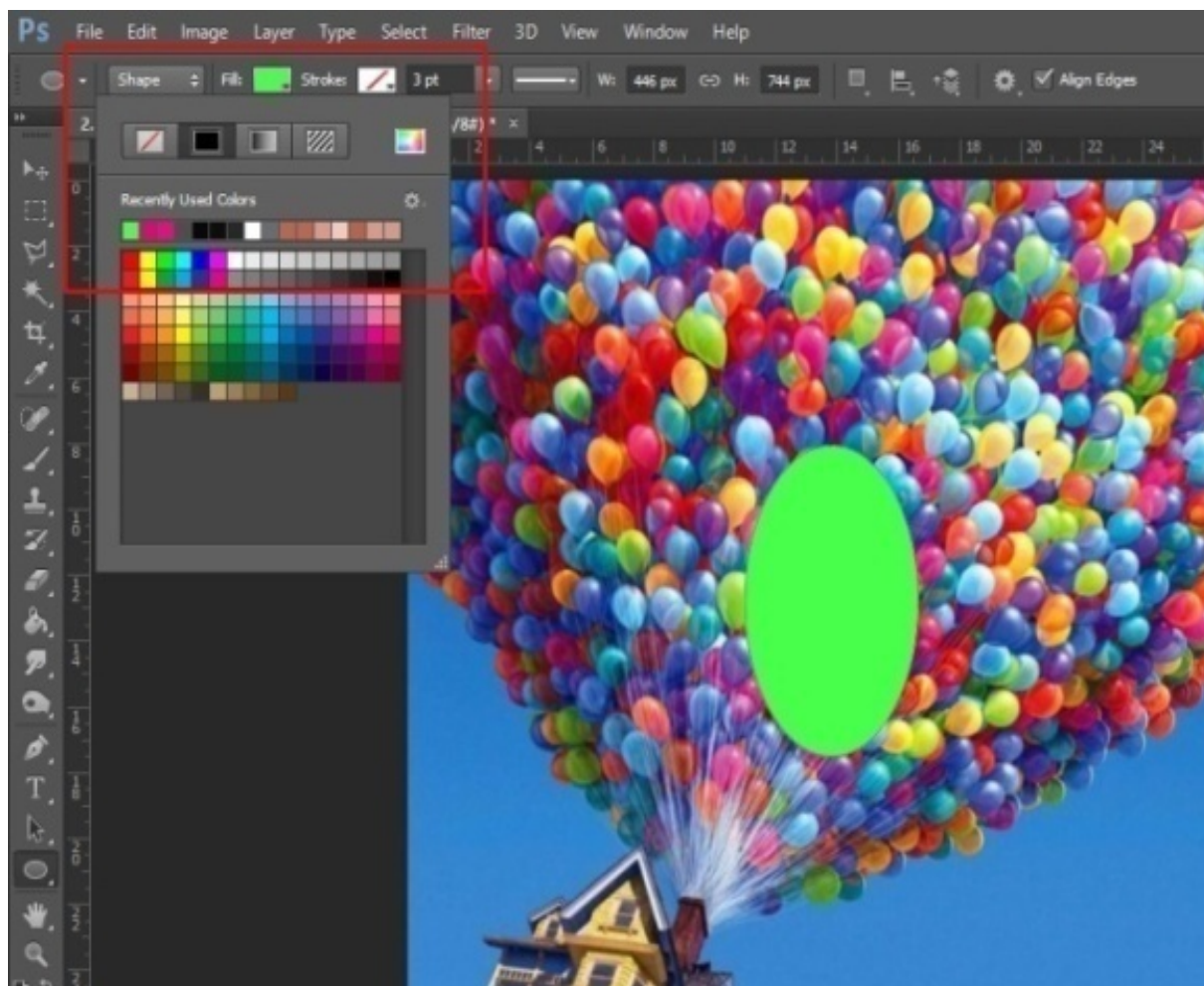
Figure 1. The "Chemuno" card design process using the Adobe Photoshop Creative Suite 6 Application