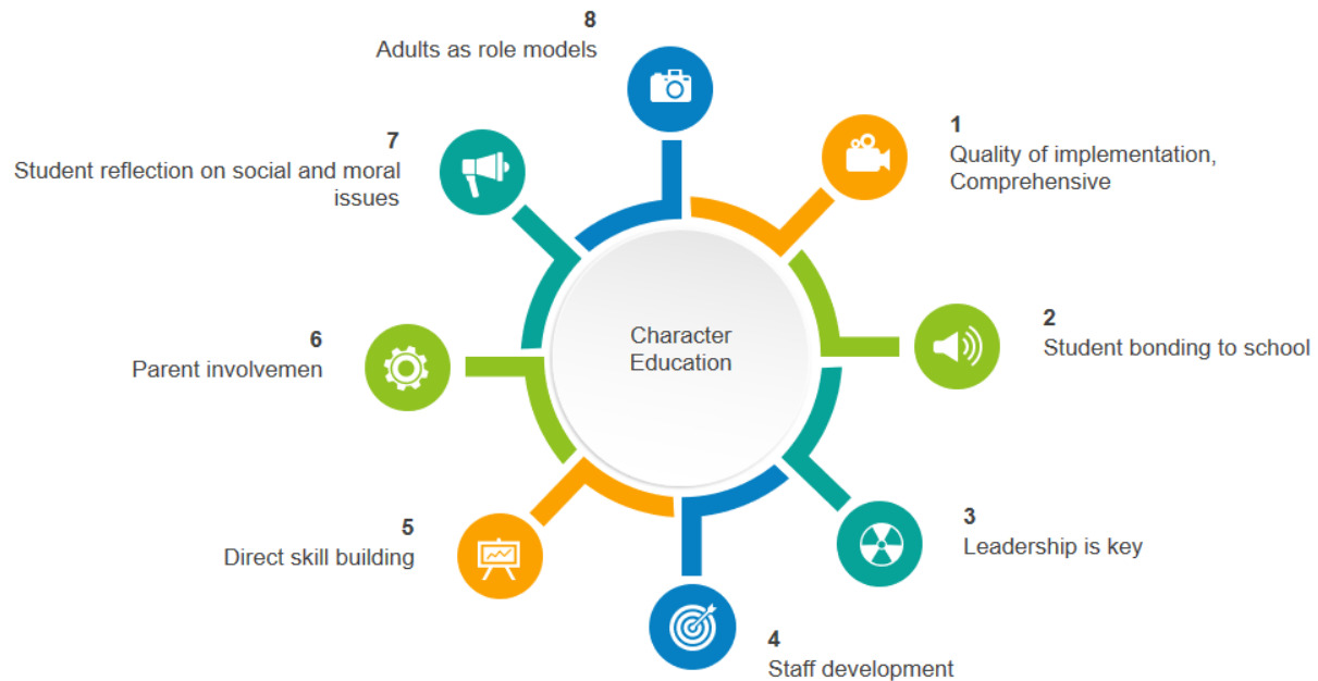
Figure 1. The key to a successful implementation of character education in schools

Effectual character education should include efforts to assess the impact of the program. At least three things can be seen in the exercise of character education: (1) the character of the classroom, (2) the development of the teaching staff, and (3) the character of the students [4]. Character education is an integral part of education in Indonesia and is embedded in all courses. However, religious education and citizenship education (PPKn) is the foundation for developing Indonesian students' character. PPKn aims to produce Indonesian people who have faith and are dedicated to God, with behavior and attitudes, to take responsible positions following their sense of morality. Education hence is not only in the things we can see, such as funding, accreditation, teachers, and policy [5], it also involves the implementing and inculcation of character education and citizenship.