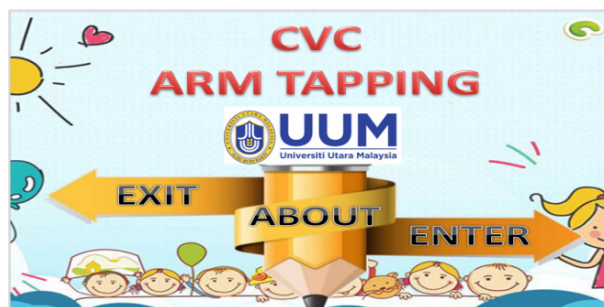
Figure 3. The initial view of the CVC Arm Tapping interactive application

learning so that students can read the CVC more effectively and provide students with phonics knowledge to spell more difficult words in the future [13]. It was designed using the ADDIE Model as a guide. The ADDIE model is the most popular teaching design model used for lesson planning because of its advantages in providing easy-to-follow process structures [35].