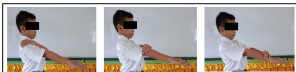
Figure 2. The Arm Tapping Technique

The execution method of the Arm Tapping technique still resembles the sound tapping technique but differs in terms of movement and limbs involved which uses hand, shoulder, elbow and wrist. For example, if a student wants to spell cat, students will say /c/ while moving their right hand to their left shoulder, say /a/ while moving the same hand to the elbow, say /t/ while moving the same hand to the wrist, and finally move the same hand again from the left shoulder straight to the wrist while saying the sound /cat/.