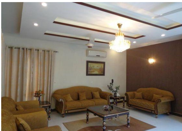
Figure 2. Low Ceiling with Cooling Device and Small Window

They are having low ceilings that are almost 9' to 10' (feet). Some of the houses were having a false ceiling and all houses were not having ventilators at the upper level of walls, in the rooms which were included in the study. Even the windows were present but most of the house habitants were using air conditioning devices (Fig 2).