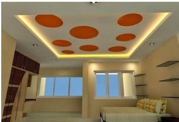
Figure 3. High Ceiling with windows

They are having high ceilings than low ceiling houses that are almost 11' to 13' (feet) with ventilation. The ventilation is provided through ventilators or large windows (Fig 3). Ventilators were present in most of the rooms at the upper level on the walls in the rooms, which were included in the study.