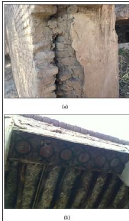
Figure 4. (a) Exterior walls of Vernacular buildings. (b) The roof in vernacular buildings. (By Author).

U-values were calculated for the entire parts of the envelope (Exterior Walls, Roofs, Floors, and Windows) to evaluate the thermal potential of the envelope for these buildings' types through U-value.