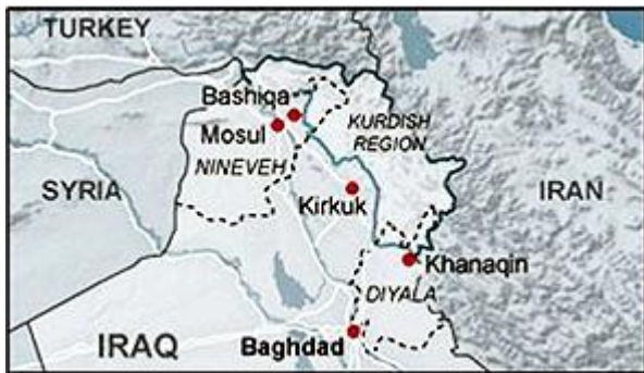
Figure 2. Kanaqin location within Kurdistan region and Iraq [22]

‘Khanaqin’ is located in north-eastern Iraq and southeast of Kurdistan. It is Adjacent by Iran from the east, and Halabja district from the north, Kalar district is located on the west side, while the rest of Iraq is located in the south, as shown in figure 2. The total area of the