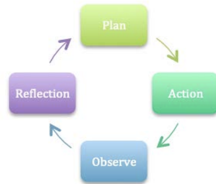
Figure 1. Steps of research

The research method used in this study is Classroom Action Research, which is a form of research that occurs in the classroom in the form of certain actions taken to improve teaching and learning in order to improve learning outcomes better than before. The steps of the research carried out are shown in Figure 1.