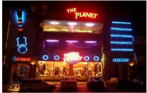
Figure 1. Front Elevation of the Restaurant

The restaurant was situated in the basement of a building, named "The Planet". The name of the restaurant was written on the top of the front door which was "Premiere Family Dining" (Fig. 1).