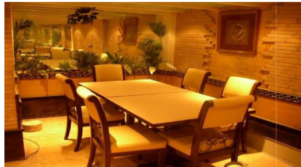
Figure 6. Small separate dining area.

A small dining room was brightly lit with halogen yellow spotlights (Shown in figure 6) as a separate portion in the restaurant.