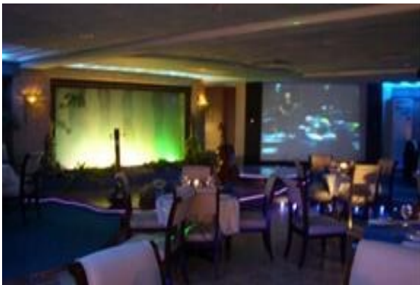
Figure 4. Multimedia Screen and Stage Screen

At the adjacent wall of the colored screen, a multimedia screen was mounted on the wall. The purpose of the screen was to show different videos for the entertainment to the patrons (Fig. 4).