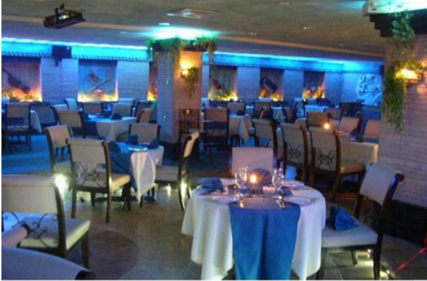
Figure 3. Up-lighting on Columns

Pillars were finished with the bricks of rust and beige colors and highlighted with white lighting on the top portion of the columns and lighting fixtures were mounted on almost two feet below the ceiling (Fig.3).