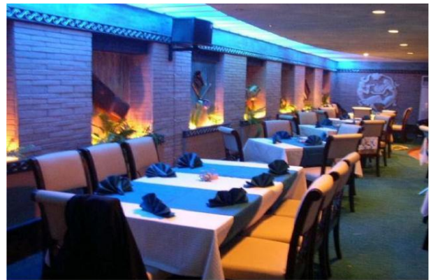
Figure 2. Blue-neon lighting in the Restaurant.

Ceiling lights were playing the main role in creating an ambiance in the restaurant. The flat blue neon lights were mounted on the ceiling. They were installed in a row on the edges of the ceiling in the dining area of the restaurant (Fig. 2). Small round spot-lights were scattered to the equal distance on the whole ceiling, having a yellow color of the light (Fig. 2).