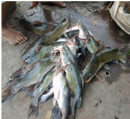
Figure 5. Fish Harvest in Lubuk Larangan

As shown in Figure 5, local people only harvest fish of a certain size (already large) and forbid harvesting fish that are still small in size. This prohibition is applied to give an opportunity for small-sized fish to grow and breed. Besides, catch the larger fish will give a tastier and more savory meat and that the fish in the area will not extinct.