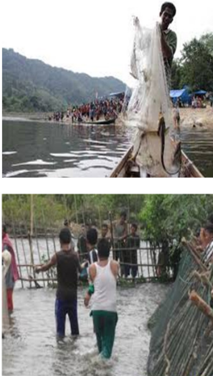
Figure 3. The use of ethno-technology in fish harvesting activities in Lubuk Larangan

problems in dealing with a particular situation and environment. This ethno-technology is produced and developed by the society or social group itself and passed from generation to generation over a relatively long period of time. In this context, ethnoscience and ethno-technology are the systems of knowledge and technology possessed by a society, a nation, a particular social group, which generally have certain special features distinguishing it from the system of knowledge and technology in other societies. Ethno-technology is a simple tool used by traditional society such as Fish Rifle, Spear, Lukah/Bubu , Nets, Fishing bamboo, Rawai , Sawuak-sawuak , Bamboo Tanggok , Pasok , Simotiak . These tools are made of natural and organic materials such as Woods, Rattan, and Roots. All of those are not made of iron, nails, and wires or other hazardous materials. This tool only takes advantage of human power which can be utilized individually or in the group. The use of these tools is environmentally friendly and there are no negative impacts on fish and the environment. Similarly, at harvest time, people only use simple equipment such as nets. Examples of using environmentally friendly fish harvesting equipment are as shown in Figure 3, where people harvest fish using ethno technology that does not damage the environment.