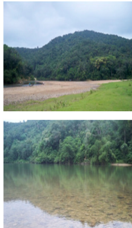
Figure 4. The Vegetation Condition of Subayang River Banks in Tanjung Belit Village

The nature conservation agency, World Wildlife Fund (WWF) of Riau, considers the tradition of Lubuk Larangan as the local wisdom of Tanjung Belit Village which should be maintained to preserve the rivers and forests. WWF of Riau spokesperson, Syamsidar, said that through the tradition of Lubuk Larangan , the residents of Tanjung Belit Village has the vision to save the environment. Moreover, this village is in the buffer zone of the Bukit Rimbang Baling Wildlife Reserve. To keep the river fresh and uncontaminated, people started the action by protecting the forest well. The action taken by the local community to protect the forest is getting good results as shown in Figure 4, where the condition of the Subayang river in Tanjung Belit Village seems to be improving and clean.