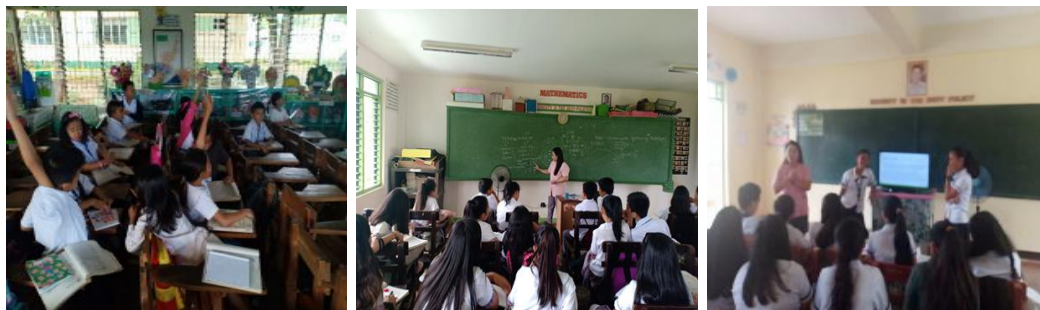
Elementary JHS SHS