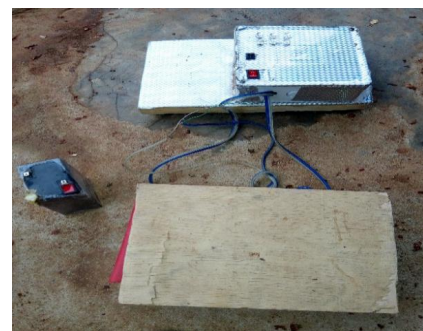
Figure 1. The Arrangement of Piezo Sensors and Connections in the System