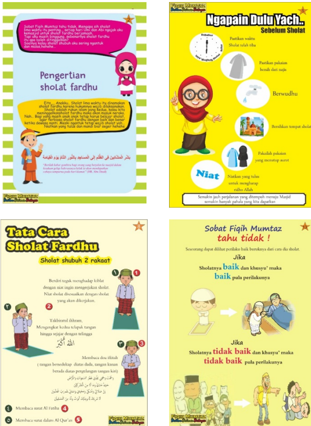
Figure 2. Teaching media of Fiqh magazine

While other criteria indicate that the material can be easily understood and can improve students' understanding. Can be seen as follows: 1) Title of magazine media (20 students answer yes and 3 answer no), with a percentage of 86.9%. 2) Fonts used in magazine media (19 students answered yes and 4 students answered no), with a percentage of 82.6%. 3) Drawing of the image of the presentation of the topic (21 students answered yes and 2 students answered no), with a percentage of 91.3%. 4) Ease of understanding the questions on the evaluation question sheet (20 students answered yes and 3 students answered no), with a percentage of 86.9%.