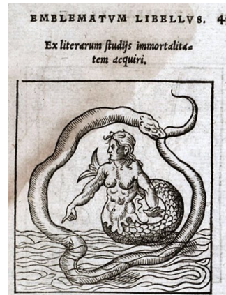
Figure 1. From Alciato [45]

to produce new meanings. The mental operations triggered by most emblematic texts can be set within the skeletal construct of the generic space of early modern epistemology, which took the coherence and the structure of the analogies for granted; then, the cross-space mappings and interactions between domains selectively projected stimuli into the blended space of the composition, thereby producing new, emergent meanings.