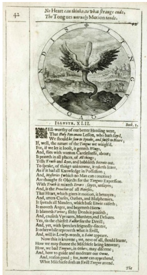
Figure 8. From Wither [51]