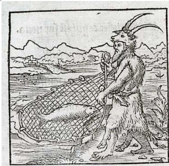
Figure 4. From Alciato [45]

The first English emblem book, Palmer's Two Hundred Poesees (1566), 7 is a good example of the early "hieroglyphic" emblematics which seemed to defy the idea of optimal relevance. Emblem 61 features an evident dyscrasia between the motto ("Againste lovers and harlottes") and the pictura , which is taken from the Paris edition of Alciato's emblems [45] and shows a fisher along a river wearing a goatskin with a big fish lying on his net (see Figure 4).