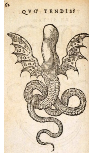
Figure 5. From Paradin [48]

Paradin’s device Quo tendis? in its 1551 original edition (Paradin [48], p. 62), was the mere combination of woodcut figure and motto (see Figure 5), and as such it was the model for Rollenhagen’s emblem 42 (Rollenhagen [49]) (see Figure 6), whose short subscriptio was just a general invitation to learn to shut up: “Garrula, quo tendis? Quo te furor impia lingua / Abripit? Ah presso, disce tacere, labro” (p. 42) [Garrulous, where do you aim at? Where does frenzy pull you to, impious tongue? / Ah, learn to hush with your lips buttoned].