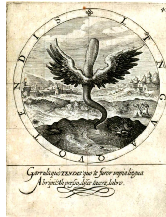
Figure 6. From Rollenhagen [49]

Significantly, in Paradin’s 1557 edition (Paradin [50], pp. 109-10) (see figure 7), short prose commentaries were added to explain the significance of each device, the person who used it, its sources, and so on. As a consequence, the device was given a universally applicable moral lesson and the nature of the work changed dramatically. In this new form, each device was far more informative and overtly ‘educational’.