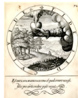
Figure 3. From Rollenhagen [49]