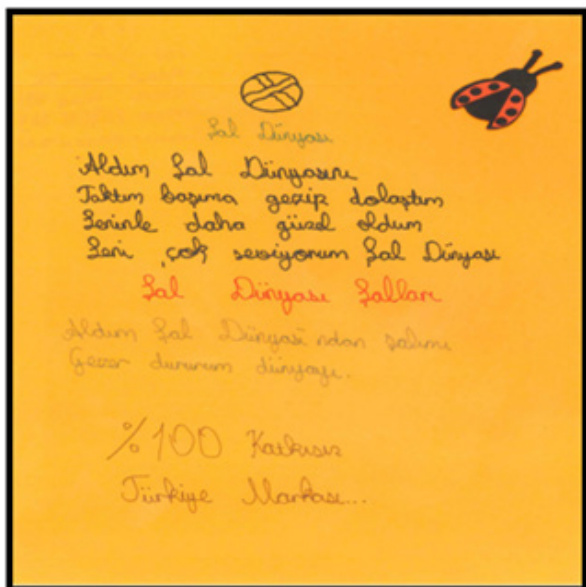
Figure 2. Second group activity sheet

Group 2 chose fabric as its product for the activity and designed their poster and film accordingly. The experts evaluated the advertising poster that the students prepared on the basis of the 5 categories mentioned in the scoring instructions. At the end of the evaluation, the group's mean score was calculated to be 7.67 and the project was found to be at a poor level. The advertising poster prepared by Group 2 for the "Product Marketing Activity" for the unit on Our Country and the World can be seen below.