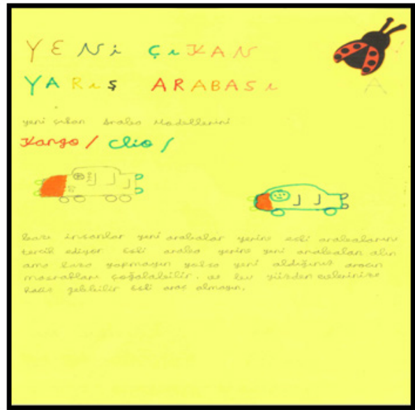
Figure 4. Eighth group activity sheet

Group 8 chose automobiles as its product for the activity and designed their poster and film accordingly. The experts evaluated the advertising poster that the students prepared on the basis of the dimensions mentioned in the scoring instructions. At the end of the evaluation, the group's mean score was calculated to be 6.37 and the project was found to be at a poor level. The advertising poster prepared by Group 8 for the "Product Marketing Activity" for the unit on Our Country and the World can be seen below.