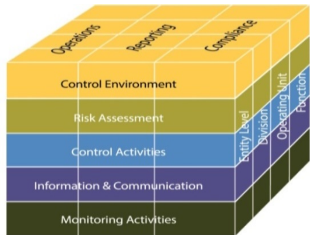
Figure 1. COSO Cube

The COSO Internal Control Model has initially been used by the private sector and for management practices in financial areas but has since been expanded to cover all sectors and all activities [26].