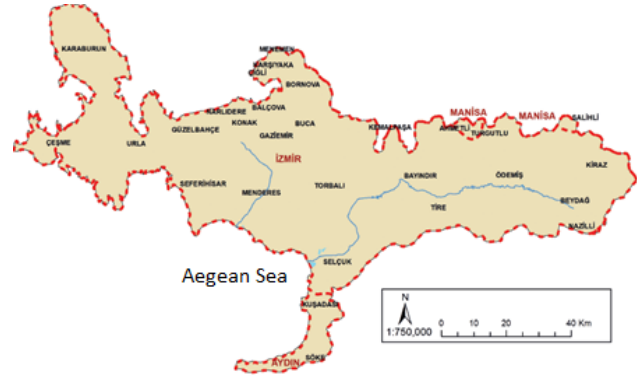
Figure 2. Küçük Menderes Basin [10]

In the study sampling and laboratory analysis were carried out according to the standard procedures described in APHA [9]. Analyzed water quality variables were electrical conductivity-EC, total dissolved solids-TDS, chloride-Cl - , nitrate nitrogen-NO 3 -N, dissolved oxygen DO, biochemical oxygen demand-BOD, sulphate-SO 4 2- , sodium-Na + , calcium-Ca 2+ and Magnesium-Mg 2+ .