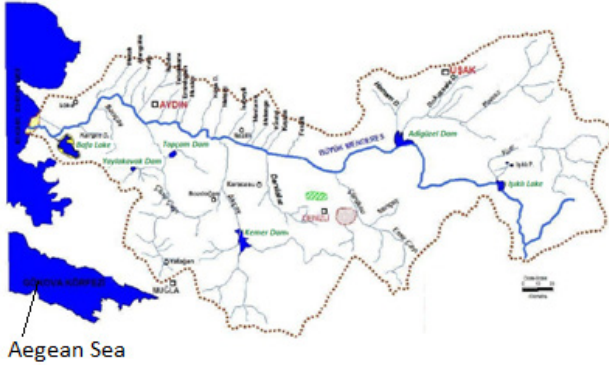
Figure 1. Büyük Menderes Basin [6]

of pollution in the basin are caused by domestic and agricultural activities. There is also relatively limited pollution due to industrial sources. The water is mainly used by agricultural domestic and industrial supply purposes [4, 5].