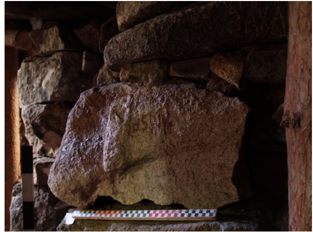
Figure 6. Sculptural bull's head in megalith 1.

Megalithic art in the Urals is presented by stone sculptures (Fig. 6). In Europe sculptural compositions are unknown. The megalithic art is presented there by engravings, rarer by painted images [8].