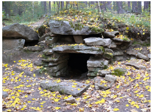
Figure 7. Megalith 2.

Over the entrance to megalith 2 the lightbox is situated through which in the equinox beams of the setting sun get into the chamber illuminating a shelf and a niche (Fig. 7). A similar construction is revealed over the entrance to the passage grave of Newgrange, and there at sunrise around the winter solstice the sunlight gets into the chamber. Similar lightboxes are recorded also in other passage graves of Ireland and Scotland [9, 10].