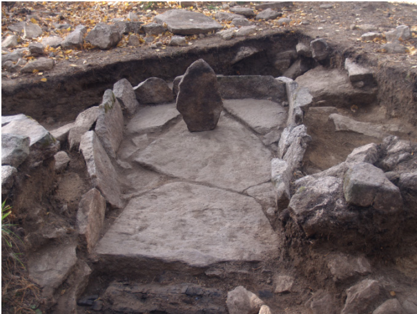
Figure 4. Stone platform on the settlement of Vera Island 4.

Ural dolmens from large boulders have the same problem: their similarity is caused by the building material. Individual features of a stone platform found on the Vera Island (Fig. 4) have parallels from Portugal (menhir in a triangular fencing from vertically put small stone slabs) [6] to Scandinavia [7]. But we may admit the coincidence of this similarity too.