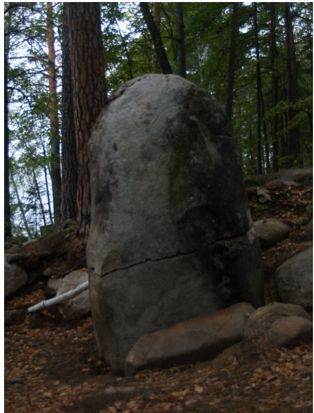
Figure 2. Grand menhir of the Vera Island.

Our menhirs and stone rows have numerous parallels in the ancient world (Fig. 2). But each standing stone is similar to another.