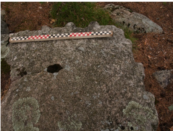
Figure 1. Quarry of the Vera Island. Trapezoid grooves for wooden wedges on the edges of stone blocks.

A bright example of this can be traced back in the Eneolithic. In recent years, we discovered several megalithic objects from this period in the Urals. They date from the 4 th to the 3 rd millennium BC and include menhirs, menhir complexes, dolmens and the ritual complex located on Vera Island [5]. The Vera Island complex consists of a series of megalithic chambers, a complex of menhirs and single menhirs, cult places, monumental sculptures, a stone quarry and several settlements of the period. The megalithic chambers differ from those in Europe, but have some detailed constructive similarities. In the settlements, rich archaeological materials were found: ceramics, stone tools, and the remains of metallurgical production.