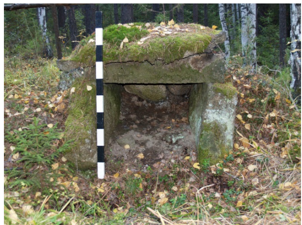
Figure 3. Dolmen in the Middle Urals.