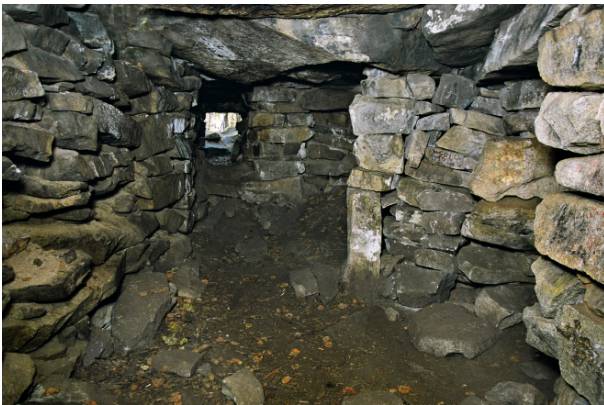
Figure 5. Interior of megalith 1 on the Vera Island.

In large megalithic chambers we can find some detailed analogies, but usually they were caused by the building technique (Fig. 5).