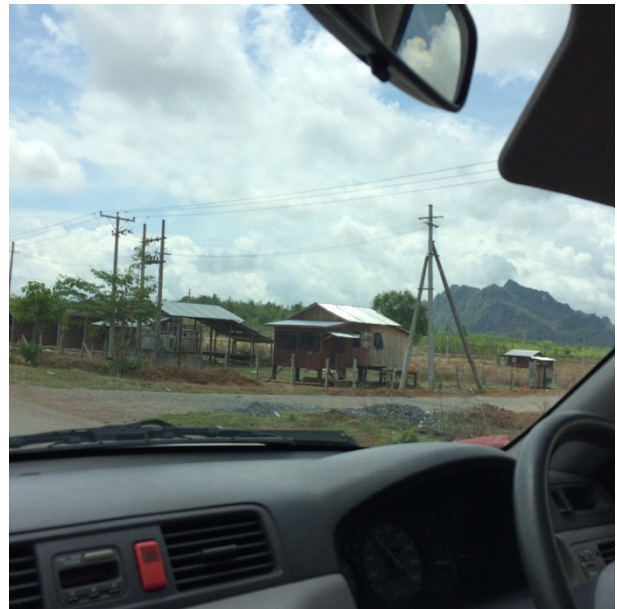
Photo 3. Entrance to the Kau Ku Village, one of the downstream villages of Hat Gyi Dam

The total number of correspondents is 82 and four in five of them (80%) are currently living in the downstream areas. The remaining 20 % are people who are working in NGO such as KESAN and Karen Human Right Group (KHRG) who are currently living in Yangon or other parts of the country. I wrote down my questions in a sheet of papers to ask in individual interviews or focus group discussions and ask them verbally and recorded their responses.