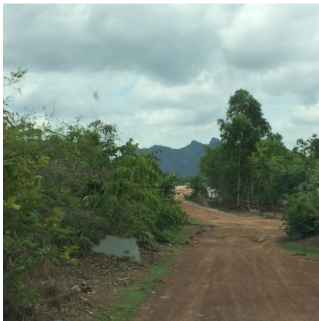
Photo 4. The Entrance to the Kauku Village