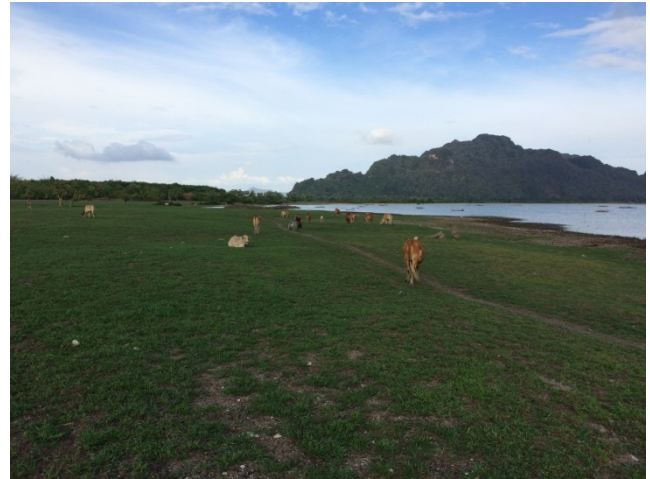
Photo 7. The pastureland near the Mi Kayin village (31.3.2016)

“When the fishermen go fishing in the Lake, their wives went together and help them. After that the wives sell the fishes in the market.” (A single woman from Mi Kayin Village, Hline Bwe Village, Kayin State)