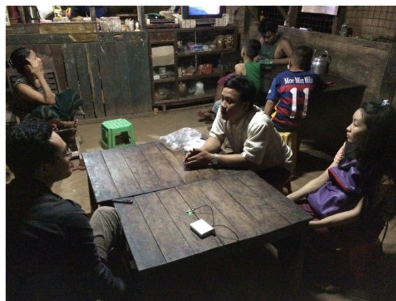
Photo 6. "In depth interview with the village head of Mine Ku village"