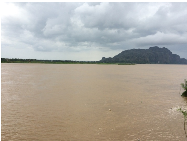
Photo 1. The Salween River, Downstream area of Hat Gyi Dam near the Mi Kayin Village. 31.3.2016

There are five large hydropower projects which are being planned along the Salween River Basin in Myanmar. One of the hydropower projects is Hat Gyi Dam which dam site is located in Karen State, a district that has seen high amounts of tension and violence in recent years. The dam project is being funded by the Electricity Generating Authority of Thailand (EGAT), China's Sinohydro Corporation, and Myanmar's Ministry of Electric Power and International Group of Entrepreneurs (IGE). The dam is expected to produce 1,100 to 1,500 megawatts of power, the majority of which will be sent to Thailand. It is located opposite to the Mae Hong Son Province in northern Thailand.