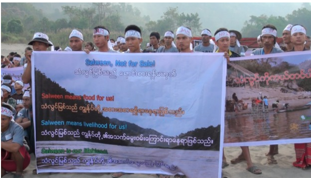
Photo 2. Protest against the hydropower dams on the Salween River basin

The Hat Gyi Dam project is a joint venture, including numerous public and private stakeholders from Thailand, China, and Myanmar. Involved parties include the state-owned enterprise Electricity Generation Authority of Thailand International (EGAT), the Chinese Sinohydro Corporation, the Myanmar government-controlled Department of Hydroelectric Power Planning (HDPP), and the Myanmar private investment entity International Group of Entrepreneur Company (IGOEC).