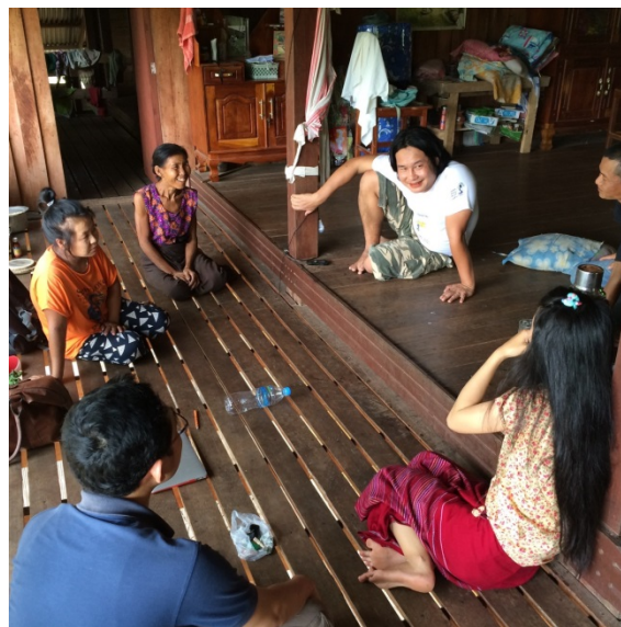
Photo 5. Group discussion with the local people in the Tadaroo Village"

Rice is not just for family consumption. They have to sell rice in the market and buy other things they need in their lives.