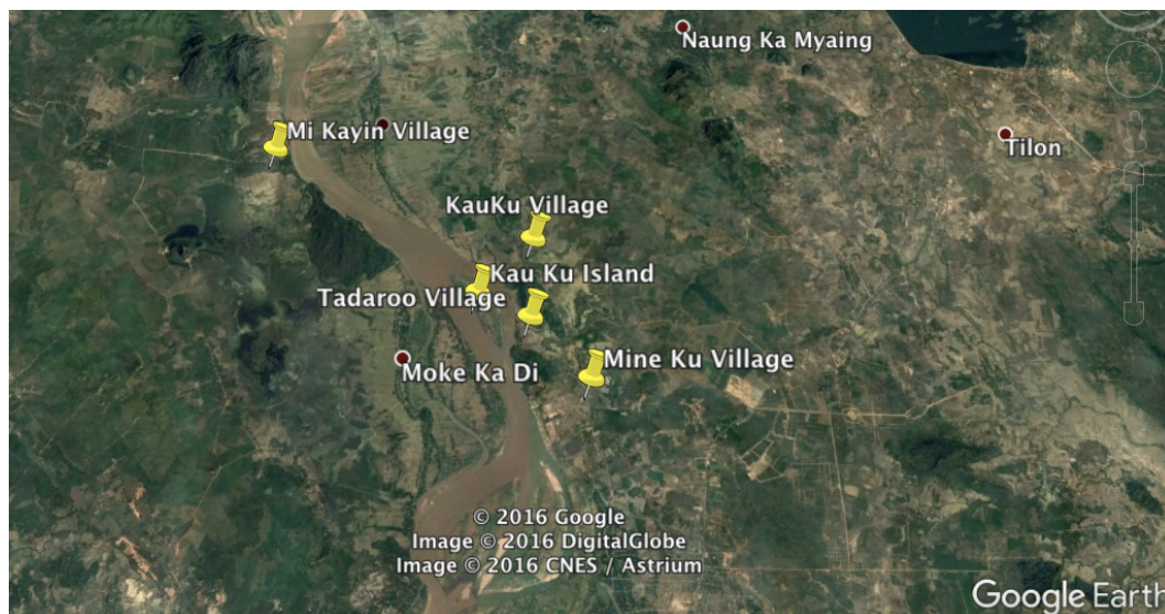
Figure 2. The map showing the four villages at the downstream area of Hat Gyi Dam

The populations of Tadaroo village, Kauku village, Mine Ku village and Mi Kayin are more than 1500 people, more than 1000 people, nearly 2000 people and more than 3000 people respectively. (Source village heads of these respective villages. Even they don't know the exact number of population in their villages and can say the rough number of populations)