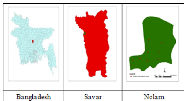
Figure 1. Location of sampling site (enlarged region)

Two standard samples were used for the purpose of quality control of the system adopted. Here Standard Reference Material 1633b (Coal Fly Ash) and IAEA standard soil-7 were used as standards in this experiment for the quality control of the measurement of elemental concentration of soil samples. They were irradiated with proton beams to reproduce the desired results. The certified reference values are compared with the measured values of the respective elements and found to be compatible (~10%).