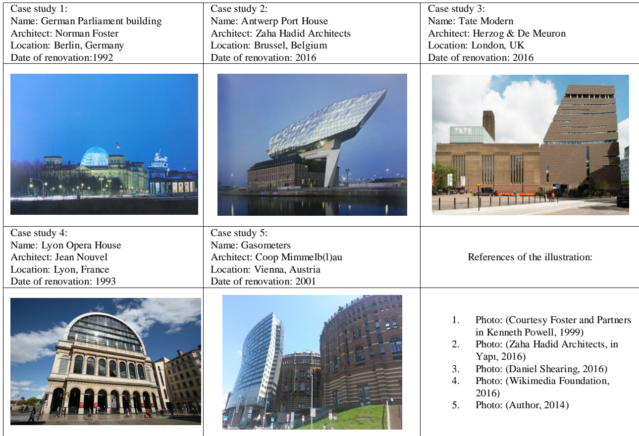
Table 2. Selected case studies

The building was severely damaged by a fire and then fell into disuse after World War II. A full restoration made, when the building underwent a reconstruction led by architect Norman Foster. The main damaged part of the building was the dome in the centre of the building. While some parts have been reconstructed, the decision has been taken by the architect to design a dome with a contemporary approach in terms of materials and construction techniques. The decision is appropriate in terms of not to cause a misunderstanding in terms of original and addition parts.