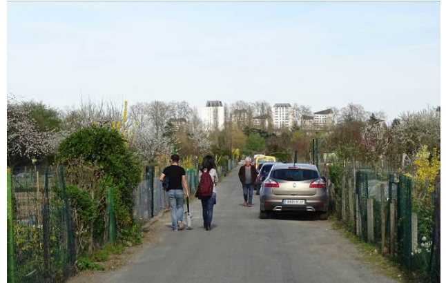
Photo 5. People walking on the way in the middle of the allotments (shot: A. Robert, 2015)