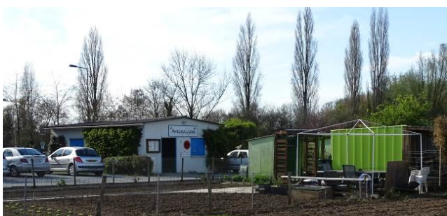
Photo 11. House of one of the three associations, which manage the spot

Beyond being a sociability place, allotment gardens are also place of education.