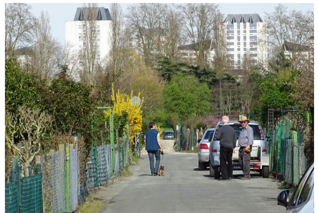
Photo 7. People going for a walk, here with a dog

During our in situ observations, we see many people on the way in the middle of the Bergeonnerie allotments. They thus come in this spot to walk, like in other urban green spaces, with different motivations. Some of them just cross the spot (photo 5): they prefer walk here than along the road, which is near the allotments. They are often students,