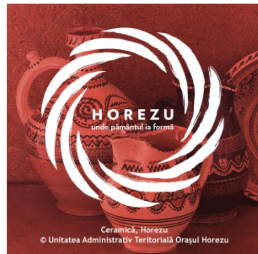
Figure 10. Logo of the campaign

Pottery workshops are constantly organized in the local information center mainly addressed to tourists, as well as in the "Constantin Brancoveanu" High school and the "Children's Club", having a target group more than 2500 youngsters from the Horezu region.