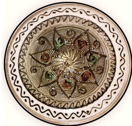
Figure 6. Traditional plates with the Horezu Rooster and the star, Eufrosina Vicsoreanu the decorations are made using the process of “jiravare”