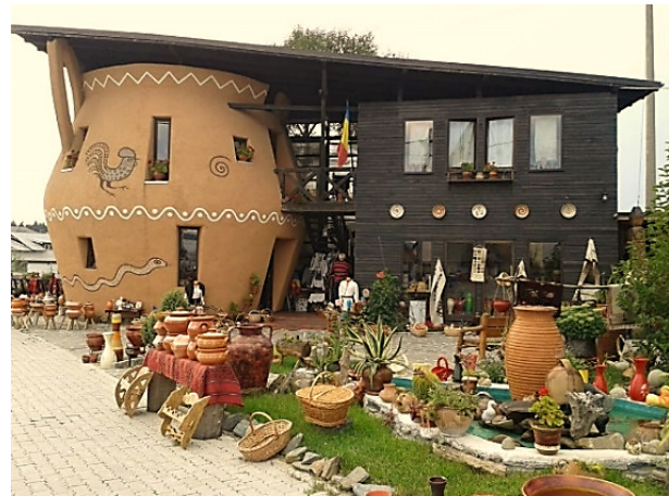
Figure 2. How the pottery is presented Region and its area of influence and sold in local shops