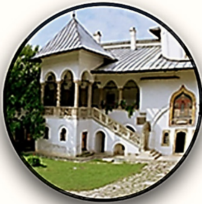
Figure 8. The Horezu Monastery