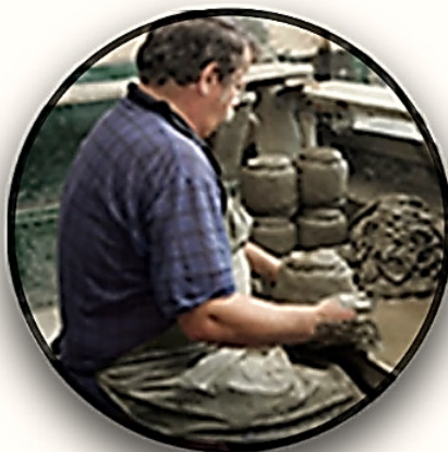
Figure 9. Potter in his workshop