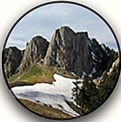
Figure 7. Buila Vanturarita