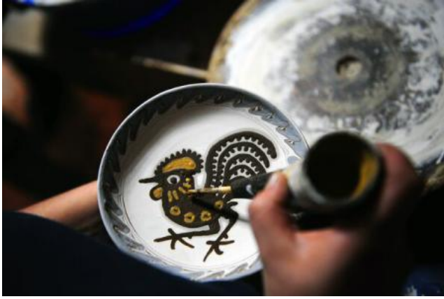
Figure 11. Decorating the plates using traditional "Horezu - where the earth takes shape" techniques and materials