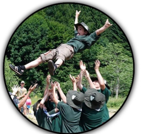
Figure 14. Activities undertaken by the Kogayon Association in the Buila Vanturarita Natural Park with teenagers from the Horezu region