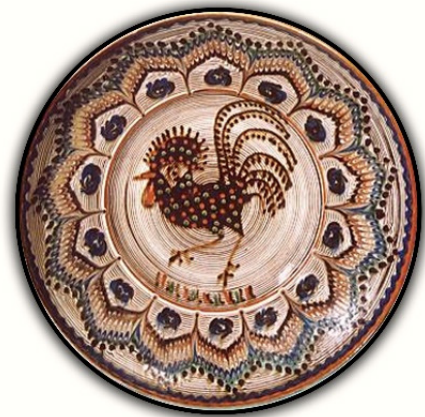
Figure 5. Traditional plates with the Horezu Rooster and the star, Eufrosina Vicsoreanu the decorations are made using the process of “jiravare”