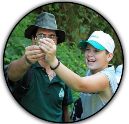
Figure 13. Activities undertaken by the Kogayon Association in the Buila Vanturarita Natural Park with teenagers from the Horezu region