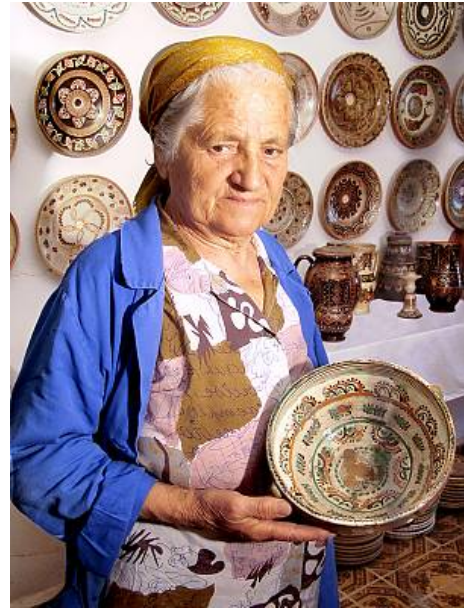
Figure 4. Traditional potter

The cultural landscape is a set of traits, characteristics, and forms of an area which provide a specific interpretation of the following elements: physical forms, natural and anthropic systems, built environment. Only through raising awareness and promoting these elements, supported by appropriate local economic development policies, the area can be regenerated and better living conditions can be provided for the residents.