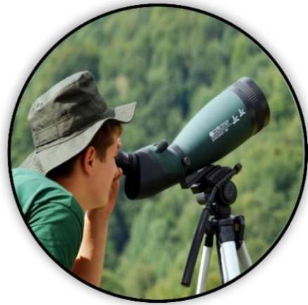
Figure 12. Activities undertaken by the Kogayon Association in the Buila Vanturarita Natural Park with teenagers from the Horezu region

This project aimed to stimulate the recognition of the existing heritage as a contribution to the local development for younger generations. Through interaction with the project team and through art education activities, the residents of the Horezu region discovered local values and resources that they formally passed over indifferently and learned to appreciate and protect them. Following this project, meetings and exhibitions were conducted and also a brochure was published that summarized all the existing Horezu heritage sites, allowing a more cohesive approach to the promotion of the area with its specific elements.