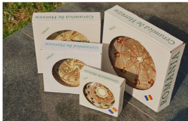
Figure 3. How the pottery is presented Region and its area of influence and sold in local shops