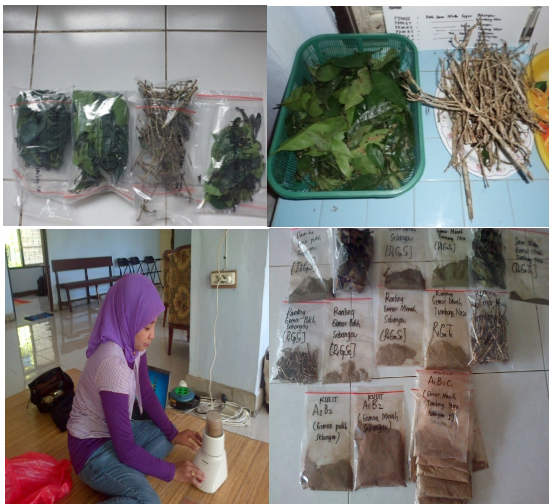
Figure 1. Preparation of research materials

The preparation of materials (leaves, twigs and bark) into powder can be seen in Figure 1 below: