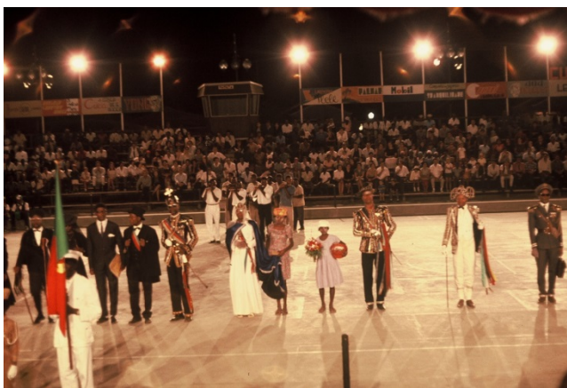
Figure 6. The court of Charlemagne in a Tchiloli performance. The Emperor is the figure at the left-center, with the white cross on the top of his crown-like hat. The Empress, in white, stands beside him, and other court officials flank the two principals. Quasi-parodies of modern dress are used; note the formal attire of the person to Charlemagne's right, and the overly-elaborate military dress of the individual, complete with attaché case, on the far right.

The theme of Tchiloli concerns the murder of the nobleman Valdevinos by his friend Prince Carloto, son of the Emperor Charlemagne, during a hunt. The family of the Marquis of Mantua, to which Valdevinos belonged, sends their ambassadors to the imperial court asking for justice. [Figure 6] The Prince, who is the only heir to the throne, is protected from his father's vengeance by influential friends as well as by his mother, the Empress. Both sides, Mantuan and Imperial, then choose lawyers to argue the case before the emperor. It is in this part of the play, performed mainly in dance and pantomime, that the individual village troupes display their creativity in dance, costumes and music. [Figure 7]