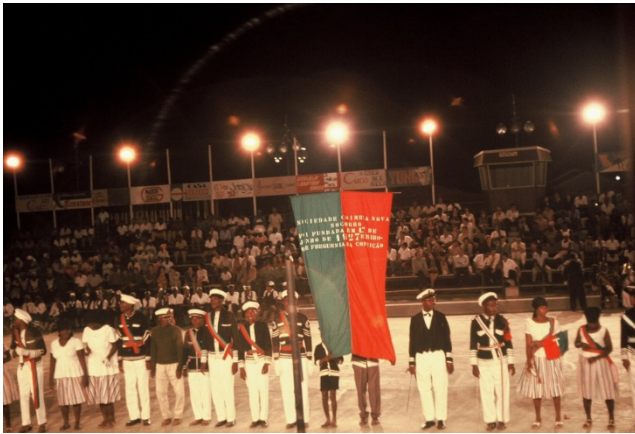
Figure 16. Sócópé marchers, with a banner showing the village and association they represent.

The first part is slow and military, and is derived from European sources, especially the minuet. The second part is quick and lively, combining the basic slow ballroom movements with a rapid African-derived rhythm, to produce a most unusual dance effect. [Figure 17] Unlike the other two dances, Sócópé does not seem to have moral or historical implications or references, and is merely an expression of the combination of European and African art forms that has taken place on São Tomé. Sócópé is also the most recent of the dances, first appearing about 1900, thought based on an earlier dance style called the Ússua . A modern performance of Sócópé/Ússua can be seen at http://www.youtube.com/watch?v=AD82VbvEb3U which took place in São Tomé city rather than in a small village. The dance is a slow promenade through the street, partly by two separate lines of dancers, one male and one female, followed by a slow couples dance that resembles a waltz. It is performed entirely in modern dress, and in its setting and movement rather resembles a slower, low-key Mardi Gras promenade.