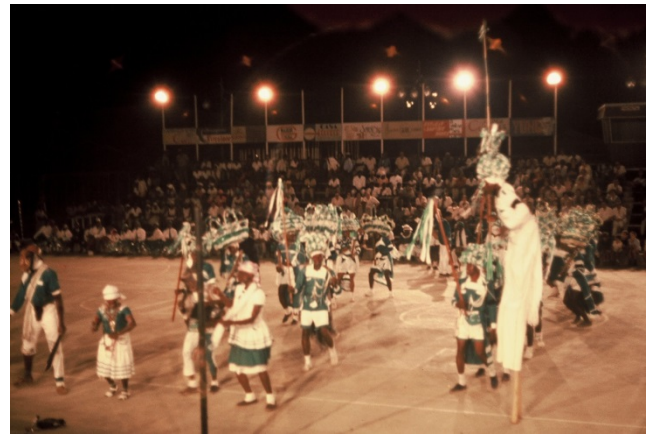
Figure 11. A view of the troupe as it parades during its dance.