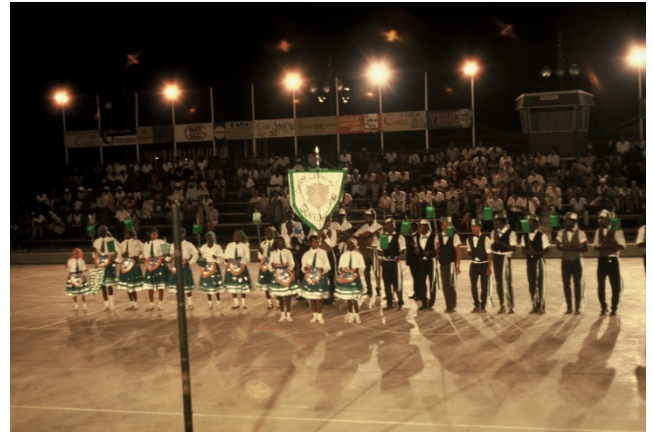
Figure 9. The group preparing for a performance of the Danço Congo