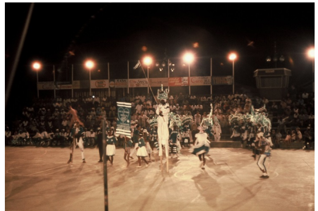
Figure 10. The troupe begins the Danço Congo performance. Stilt-walkers are very common and popular today; whether this was true in the past is uncertain.