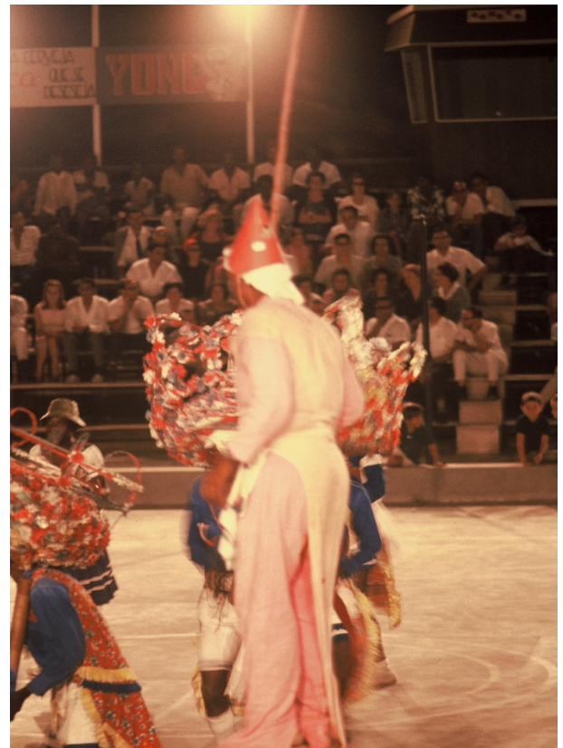
Figure 15. A close-up of the second group's stilt-walker