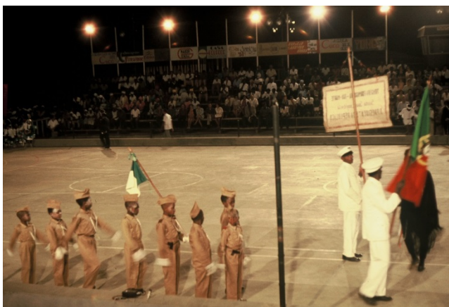
Figure 7. In the sports stadium of São Tomé, a youth group parades before a performance of Tchiloli . In the colonial era before Independence in 1975, the Portuguese government encouraged such activities, even though tourism at the time was minimal.

After much debate, and accompanying theatrics, the Emperor condemns his son to death, and the finale of the play contains loud and violent dancing and music, representative of the tragedy of the outcome. The dialogue is