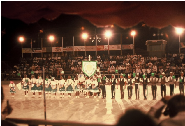
Figure 8. A troupe lines up, preparing to perform the Danço Congo . The banner announces their village and association. As was common, children, even more than adults, were encouraged to take part in the performances by the colonial government.

A performance of Danço Congo is available at http://www.youtube.com/watch?V=dbg5cqxdL70 , which was filmed in a village square and is highly informal. The central character and main dancer is the Devil, dressed in bright red, and the performance literally and figuratively revolves around him. As with the performance of Tchiloli described above, music is provided by customary instruments rather than modern ones; rattles, gourds, and some small drums accompany the dance. Modern incongruities also appear here: the Devil, while clad entirely in red, is also wearing modern gym shoes!