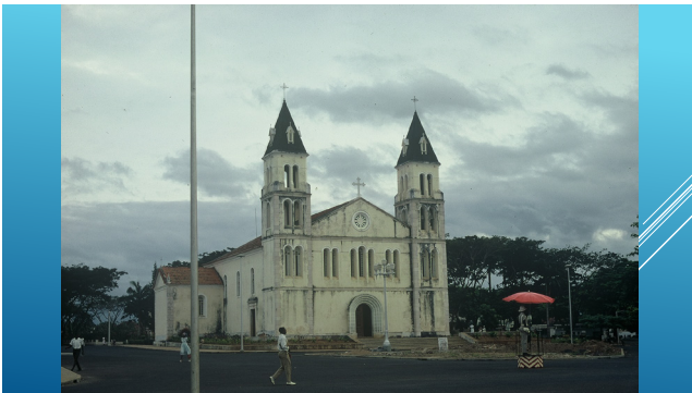
Figure 3. The Cathedral of São Tomé as it appears today. The current cathedral was built in 1834 on the site of the original. It would have been about here that bishop Lobo saw the “Jewish” procession.

Each village's group is costumed in brilliant and original dress, which is often different for each settlement and which is often changed, though not necessarily on an annual basis. Flags and banners of various kinds are also a part of a group's regalia. Music is provided by a band playing African-derived instruments, mostly variants of drums, other percussion instruments, and simple stringed instruments. [Figure 4] In recent years, European instruments, such as flutes and guitars, have become more common. The repertoire of each village group can take from two to six hours to perform, but entire shows are usually put on only by an individual village at its own particular festival. For the island-wide performances, each village is usually limited to between one and two hours for its presentation; nevertheless, the festival may last several days.