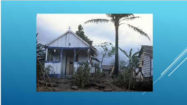
Figure 2. A typical poor village in contemporary São Tomé: Any open area in the village could have been used for a performance of one of the island's dances.

[Figure 3] would be most often used for these performances. If the latter, it is no wonder that Bishop Cunha Lobo was awakened during the night.