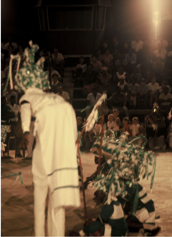
Figure 12. The stilt-walker and his co-dancers in the Danço Congo