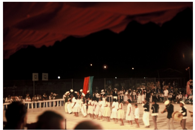
Figure 17. Sócópé performers marching

gone, and rather more modern objects such as attaché cases and sunglasses have appeared. Increasingly, the dances are made for public performance, and for tourists, rather than being simply an expression of the islanders’ culture created and performed only for themselves; this is clearly shown in the filmed performances referenced above, especially in the presentations of Dança Congo and Sócópé/Ússua . As São Tomé becomes increasingly involved with the outside world (a phenomenon that can only grow since the possible discovery of oil beneath the island’s territorial waters, as well as greater access and facilities for tourists) we can expect that the dances will change even more; one can only imagine how the dress and morés of American oil-well drillers will show up in later versions of the dances.