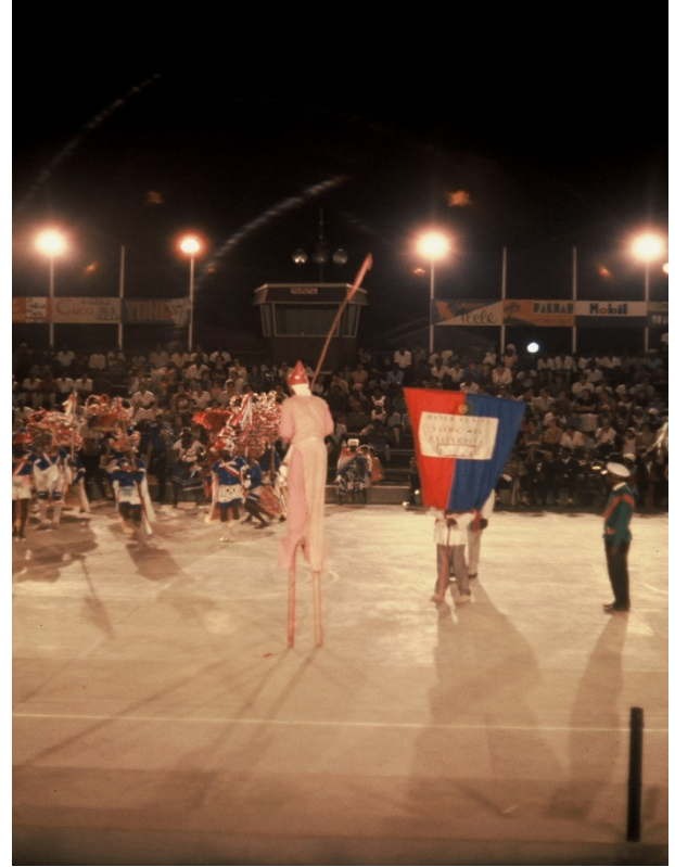
Figure 14. The stilt-walker and his co-dancers