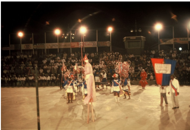
Figure 13. A second Danço Congo group performs. Differently-colored costumes identify different villages and performance groups.