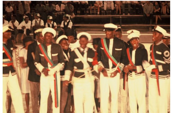
Figure 5. Some of the musicians for a Sôcôpê performance: As is now common, the dress is modern, rather than an approximation of what would have been worn in the 17 th century, or what was imagined to be the dress at Charlemagne's court.