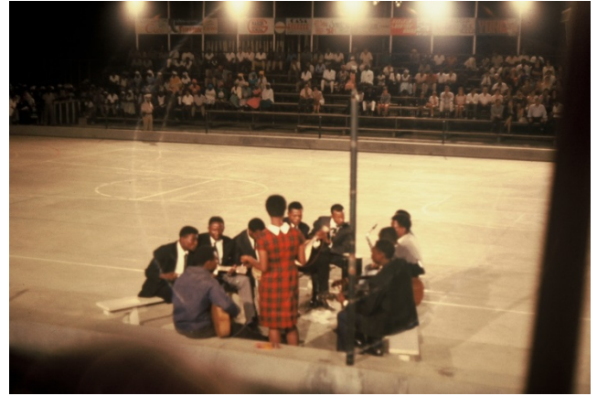
Figure 4. A band prepares for a Tchiloli performance. Modern dress and modern instruments are often found today for such performances, especially when it is an ad hoc one not held at the usual time, in August or September, for an island-wide competition.

gradually dropped over the decades or centuries; thus, any “Jewish” remnants in the music and dancing would have been lost long ago. [Figure 5]