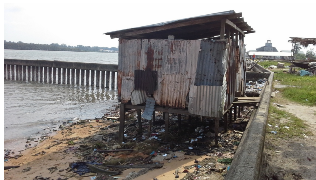
Figure 1. A typical toilet structure in Opobo town at ebb tide

contained in human excreta produce phosphorus and nitrogen in the river. This increase in nutrients results in algal blooms, loss of oxygen, fish kills, loss of biodiversity, amongst other problems [14]. Additionally, this algal blooms causes some species of algae to produce biotoxins (natural poisons) that can be transferred through the food web, potentially harming higher-order consumers such as marine mammals and humans [9]. Alabaster and Lloyd [15] noted the harm caused fishes from suspended solids in surface water. They reported that fishes are killed and their growth reduced, and that fish eggs and larvae were hindered from full development, including a general reduction of available food for fishes.