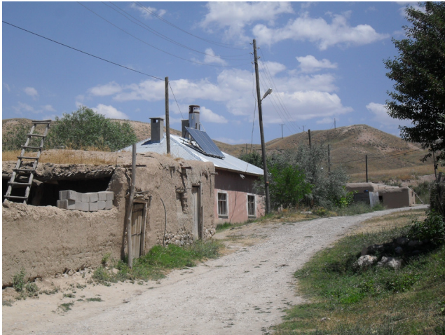
Picture 4. The combination of traditional and modern architectural characteristics (solar power)

Despite the common tendency to keep livestock, not all families had a hayloft built into their house. The practice of keeping cattle and sheep for sale led to spatial re-arrangements. A large majority of houses (46%) make use of turds as fuel, due to their availability. The stove is frequently used for the heating purposes, as none of the houses have a central heating system. The storage area is usually on the ground floor. Almost all houses have a garden with different types of fruit. The most common are apricots and mulberries, which are sources of income, especially fruit dried on the roofs (Lake Van has a ‘semi-Mediterranean’ climate). Some family members reported producing more than 400 tons annually.