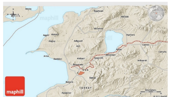
Map 2. A closer look at Agartı (Ayanis) on the Map

Keywords Ayanis, Van, Material Culture, Cultural Beliefs, Social Change