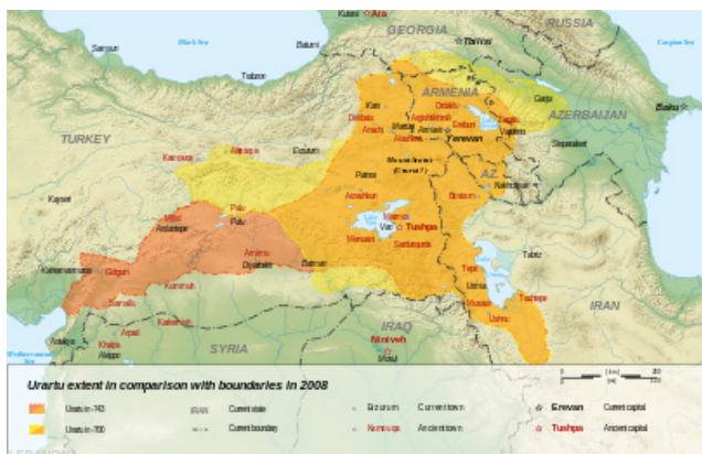
Map 1. Eastern Turkey, Van