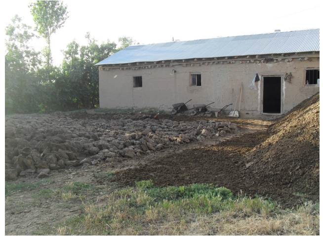
Picture 3. A typical barn

(48%) to build houses consisted of a few rooms. Few concrete houses (9%) are built to modern standards, others are made of briquette blocks (9%); mud (adobe) and briquette walls (9%); mud and concrete (4%); or other traditional materials (13%).