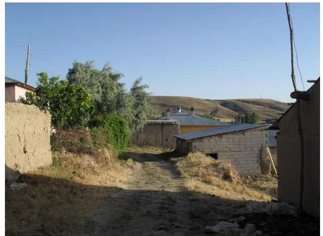
Picture 1. A View from the Village