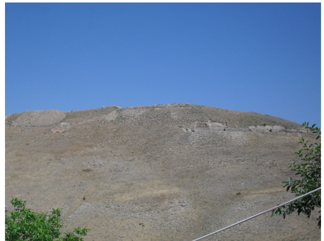
Picture 5. Ayanis Castle

The research was conducted in Ayanis, a village situated between the eastern shore of Lake Van and a semi-mountainous area. The major research questions were based on the need to discover not only cultural values, but also socio-demographic variables. The exploratory research was designed based on the villagers' values which have been impacted by the variables on social change, such as migration, the geographical location of the village, the contact with the archaeological teams as well as the historical Ayanis castle, which is a symbolic representation of the past. Due to the reasons emphasized above, the study does not claim to investigate all exogenous and endogenous variables about social change in the village. Therefore, the collection of demographic and sociological data is an innovative approach which has revealed the basic characteristics of the village.