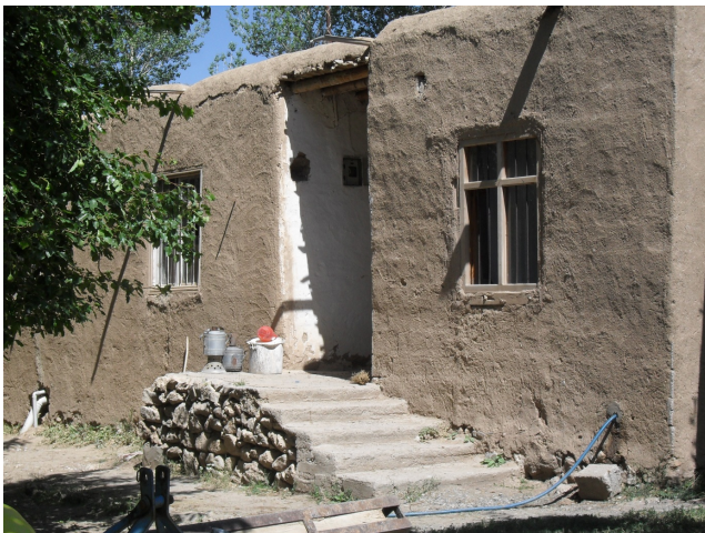
Picture 2. A Traditional House in the Village

In general, the geographical and socio-cultural characteristics of the region involved keeping livestock as part of the subsistence economy (80%), rather than to engage in agricultural production (20%). The lack of industrialized agricultural production plays an important role in terms of shaping not only spatial arrangements, but also social relationships.