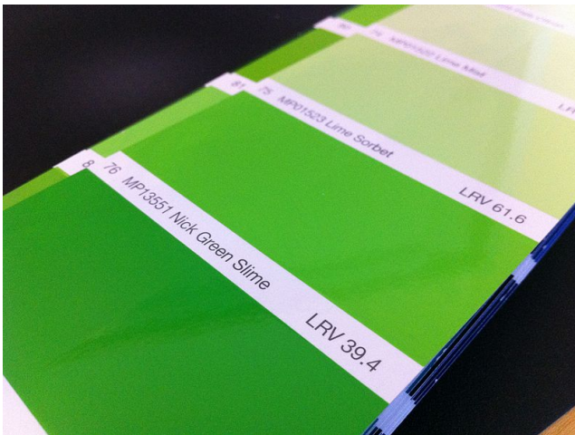
Figure 3. Light reflectance value of different surfaces

Light reflectance value is the total quantity of visible and useable light reflected by a surface in all directions and at all wavelengths when illuminated by a light source. LRV is a measurement that indicates how much light a color reflects, and conversely how much it absorbs.