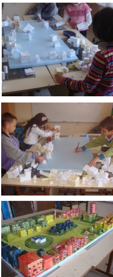
Picture 2. Images from workshop of students

In the fourth stage of the activity, each group made a presentation of the city it built to other groups.