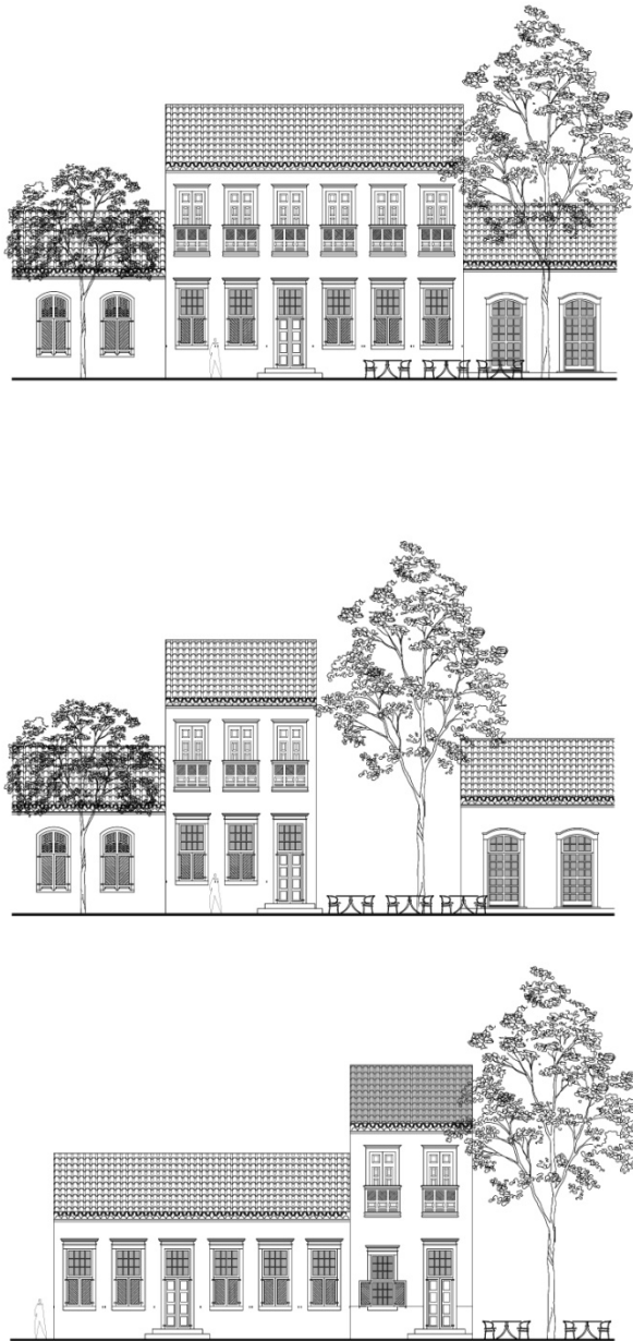
Figure 1. The ground floor and the two story houses built on the alignment of narrow lots. Drawings by André Marques.

Narrow houses built on narrow lots on irregular blocks alongside narrow streets – this was the Brazilian urban morphological pattern during colonial times.