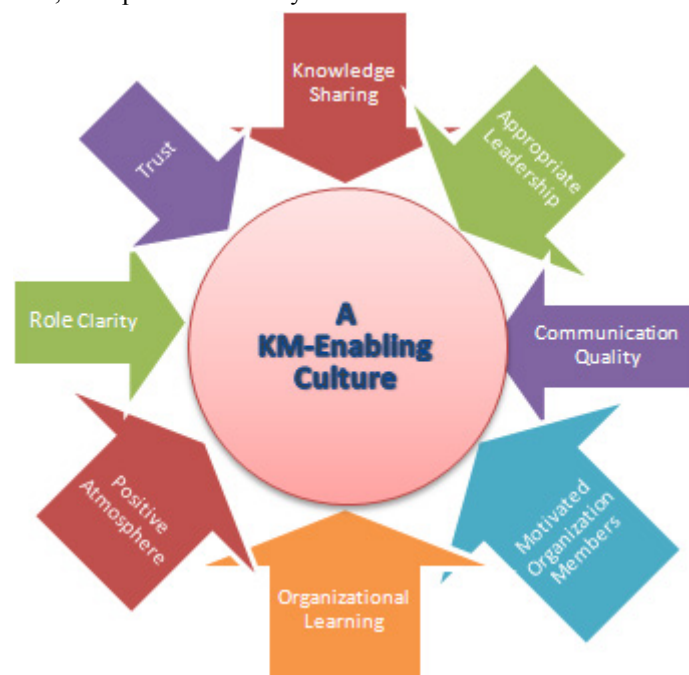
Figure 2. Attributes of a KM-Enabling Culture