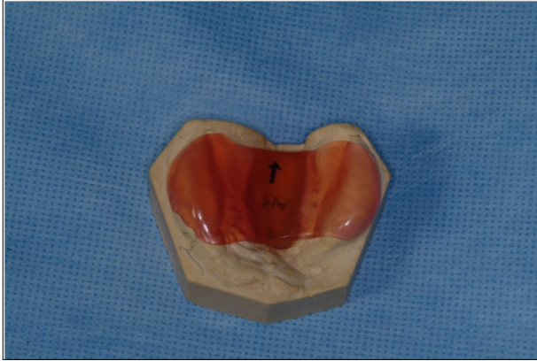
Figure 2. Hotz type appliance on maxillary dental cast

possible for the device not to fit as securely as it did when it was initially placed: parents are then advised to use a paste denture adhesive to aid in retention. The Hotz appliance is often used to assist with both bottle-feeding and to allow some breast-feeding in infants with cleft lip and palate. There is no specific research about the success of a Hotz appliance, but it is believed to have a positive impact on cleft patients [11].