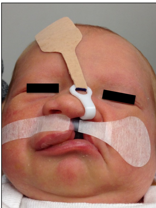
Figure 4. Unilateral DynaCleft® and nasal elevator in place

While traditional surgical adhesive tape (e.g. Silk tape, Steri-strips®) have been used in the past, unlike tape, DynaCleft® offers the benefit of being able to provide a constant approximation force with an elastic center that allows it to conform to a baby's mouth better because of its ability to expand and contract [34]. Additionally, the controlled force that it provides to the prolabium and premaxilla could improve surgical results and decrease the necessity of early lip adhesion surgery. As the DynaCleft® device is premade, there is no need to create custom-made devices for the molding process. Therefore, there is no labor cost associated with DynaCleft® therapy. A recent study by Monasterio et al, DynaCleft® in use with a nasal elevator was able to produce results similar to that of NAM therapy [35]. Nasal elevators were found to improve the shape of the nose and alae as well as reduce the need for primary surgery to the nose in patients with unilateral cleft lip and palate in a study by Abidu et al (Figure 4). Consequently, this technique provides an emerging method of treatment in cleft lip and palate care [36].