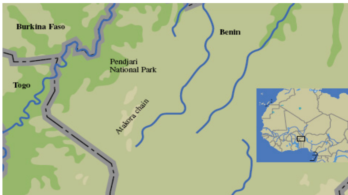
Figure 1. Location map of the biosphere reserve of Pendjari on the figure with the Atakora chain as southern border of the reserve, the Pendjari River the north-western border and the country boundaries marked in grey.

We identified homogeneous sites using the soil, vegetation and rainfall maps of the Pendjari Biosphere Reserve. A total of 84 termitaria (28 per land-use type: protected areas, farms and fallows) were surveyed in the study. We installed 50 m×50 m plots to count and measure termite mounds. Mounds surveyed in the Pendjari National Park were mostly epigeal termitaria. Several authors [13, 25, 26] identified them as Macrotermes genera buildings in tropical savannas. The status of each mound (living or dead and abandoned) was assessed by slicing the mound to check for presence of termites and by looking at its colour. Living mounds are mostly red while the dead and abandoned ones are black sometimes going to white. Geographical coordinates and altitude of each termitaria were recorded. Around each mound, a single plot of 900 m 2 (30 m×30 m) was established to record the existing woody species. The height and four radii of each termitaria were measured and the mean radius was used to calculate mound areas [19]. Plant species found on mound were identified and individuals' woody species counted. The plants species were identified at the National Herbarium of Université d'Abomey-Calavi (Benin).