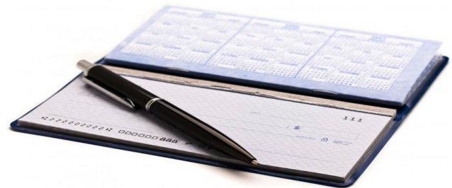
Image 1. Representative Checkbook