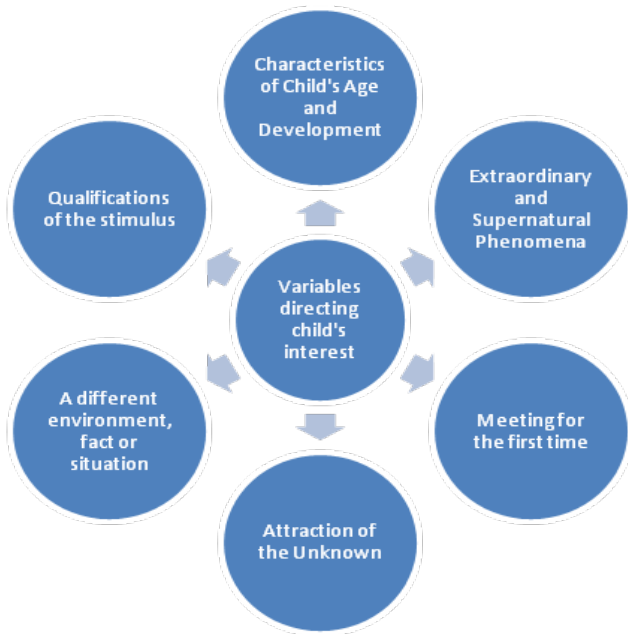
Figure 4. Variables directing the child’s interests [15,70–73]

actions and behaviors; and visuals drawn clearly and attractively with bright, contrasting, plain, and vivid colors. In addition, children belonging to this age range like supernatural, attractive, new, mysterious, curious, extraordinary, entertaining, amazing, funny, unusual, interesting, and exciting books, and an unexpected and new situation, incident, environment, experience, and elements. Thus, if the stimulus is a book, these qualifications must be intertwined with the formal and contextual properties of the book.