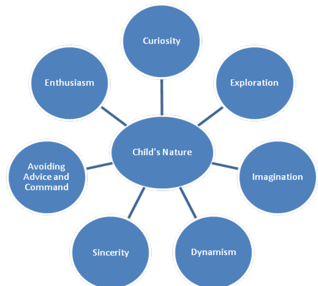
Figure 2. Child’s Nature

Children have realities peculiar to their own natures. They are human beings who like laughing, playing, and enjoying. Their rich imaginary worlds and their motives requiring consistent dynamism are their most specific characteristics. The will to experience adventure and exploration through the sense of curiosity are fundamentals in their lives. The power of imagination frees them from the limitations of real life; children explore a new world in their minds using words, symbols, and images with the aid of the power of imagination. They can shape this new world as they wish; create new ideas in it and find creative solutions to problems. They care about excitement and enthusiasm for how they act and what they do. All these characteristics show that children attribute values and senses to life and the world differently from adults.