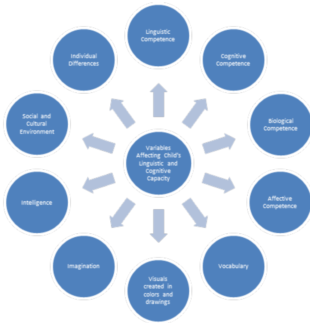
Figure 5. Variables Affecting the Child's Cognitive Capacity [15,16,16,77,78,84].