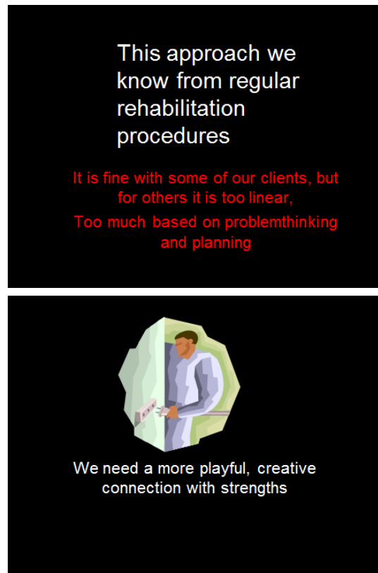
Figure 2. New understanding