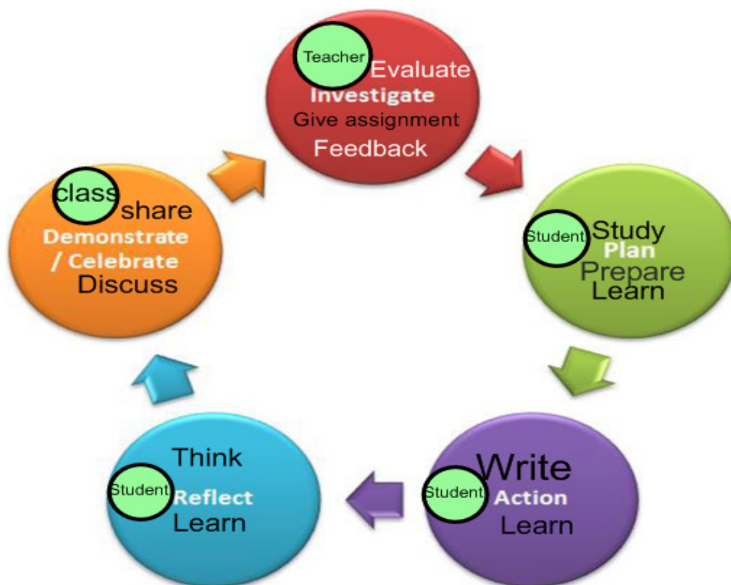
Graph 1. The Journal Learning Continuum. Journal writing is thought of as a learning continuum in which students have several opportunities to learn throughout the continuum chain.