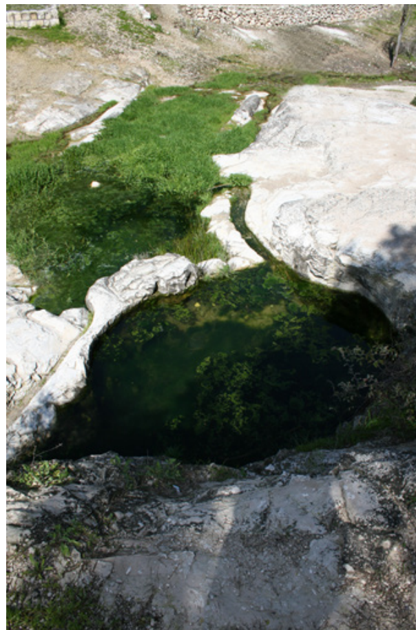
Figure 2. The Nevoria pool in March 2013 (winter).

Massive Chara growth is correlated with organic enrichments of the water during rainy period that can give large nutrient base for charophytes development. Charophyte species Chara gymnophylla has wide distribution in Israel [5] over Mediterranean climatic zone [19] but in the Upper Galilee Mountains it is only one water body which it is inhabited. Other identified species in the pool were mostly diatoms that attach macrophytes, filamentous algae and stones in the pool.