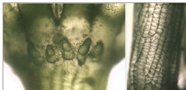
Figure 4. Chara gymnophylla : 1 – axis with stipulodes and base of whorl, 2 – axis with axial cortex