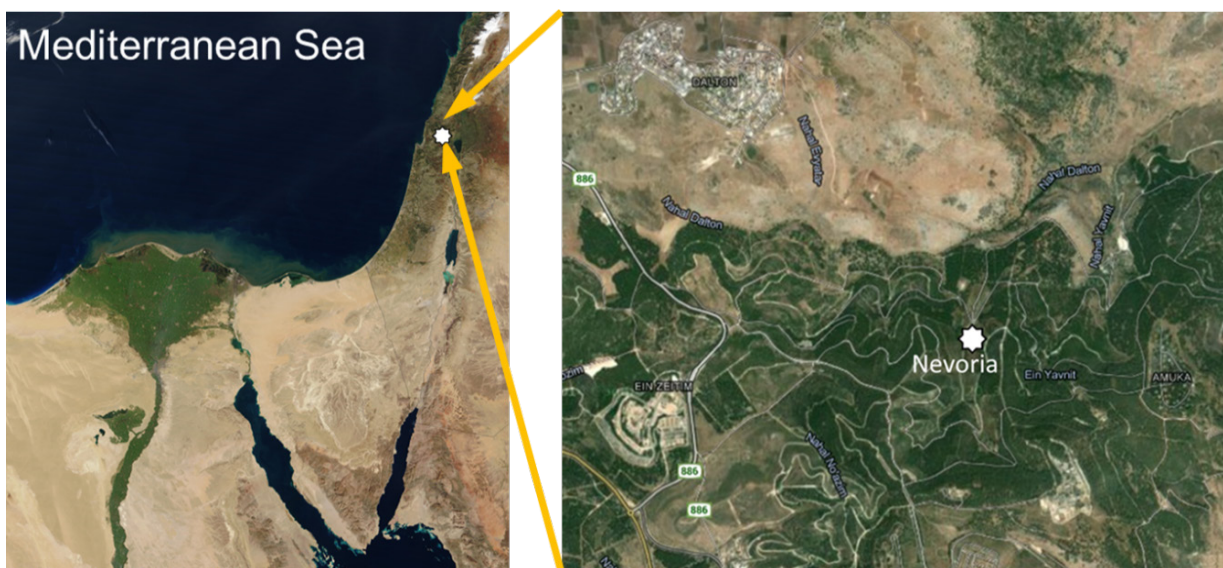
Figure 1. The Nevoria pool locality in the Upper Galilee Mountains, Israel.

The Nevoria natural pool is placed in the upper part of the Upper Galilee Mountains (Figure 1) on altitude about 690 m above sea level with coordinates 33°00'036 N, 35°30'567 E on the western slope of the rift valley near the Dalton settlement. It is small, about 6-15 m in diameter and up to one m deep (Figure 2), filled by natural rainy waters during winter from the small stream Ein Nevoria that is right tributary of the Dalton stream, which followed to the Hatsor stream, the right tributary of the Upper Jordan River in the Northern part of Israel. While the Dalton and Hatsor streams (in the upper part) are winter streams only, the Nevoria pool is permanent. Pool is located on a forested north faced hillside of the Galilean Mountains with Pinus halepensis near the First Synagogue protected historical site, and used for recreation, year-round, but mostly in summer. Climatic condition of the Nevoria basin area is the most high and humidly in the Upper Galilee Mountains with mean annual rainfall about 800 mm. Annual mean solar radiations in the pool area is rather high, about 182-189 kg-calories cm 2 year -1 [15], like in the Judean Mountain and even in the upper Negev Desert. Therefore environment is very favorable for the development of photosynthetic plants, like Pinus halepensis in the forest, as well as Nymphaea in the studied Nevoria pool [16], and charophyte algae which are truly photosynthetic organisms.