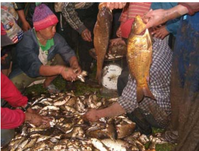
The School pond selling fish