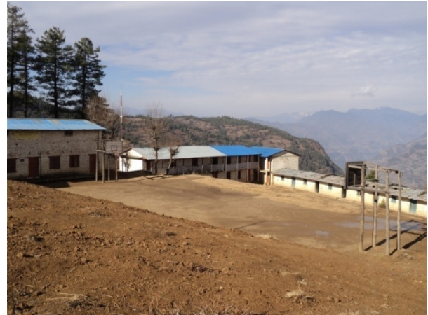
Photo: The Himanchal School that makes resilient children