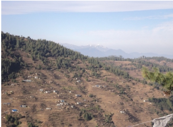
Photo showing the terrain of Ramche and Nangi surroundings

Dashain and Tihar 2 and also worship 'nature' as their 'Goddesses'. Reaching Nangi usually requires two to three days of travelling from Kathmandu, consisting of a seven hour bus ride or a thirty five minute plane trip to Pokhara, the second largest city in Nepal. From Pokhara, one must travel by bus or taxi for up to five hours to reach to Beni. And a long trek from Beni, with porter assistance that can be hired, it would take almost dawn to dusk to reach to Nangi.