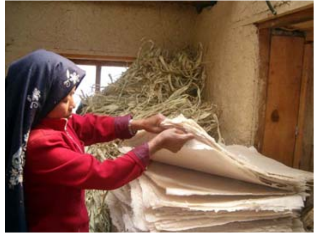
Photo showing project personnel with Handmade Paper from a local plant 'lokta'

added to scholarship fund and administered according to pre-set criteria for scholarship purpose. Read Nepal, an NGO, has supported by providing more than 2000 books and also provided training to teachers about library management.