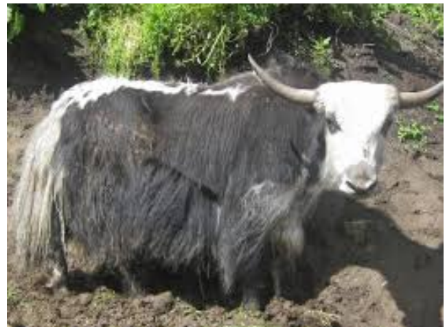
Photo from the Yak farming project

The NGO spotted the tradition of Yak farming in the area and asked the community if this was an option to pursue and could do more of it for economic development. The NGO introduced thirty yaks, in the 1997 to the Khopra region below the Annapurna and Nilgiri Himalayas. This project was a joint-venture of Himanchal High School and Paudwar High School. The program has been very successful, as there are over one hundred and forty Yaks as of now which are producing a good source of income for the schools. Almost everything from the yak is used to sustain the life of the herdsmen and their families and is used either directly or sold to provide an income. What domestic cow and buffalo are for many other South Asian communities, the Yak is for the Sherpa and the Magar communities in the Himalayan region. Yak products are sold in local markets and in Kathmandu, while some products are also sold overseas. The herdsmen and their families obtain nearly all their needs from yaks.