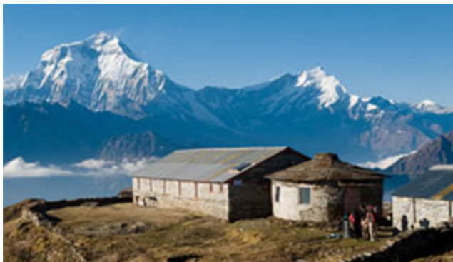
Photo shows a view of the Khopra Tourist Lodge

The NGO built its first camping ground in Nangi village for tourists in 1996, which produced some income for the school. Following success of this first micro enterprise, they built two more camping grounds in Khopra as a joint venture project with Paudwar High School. Today this is a commercially viable tourist place that charges US ten dollars for a night's stay per person.