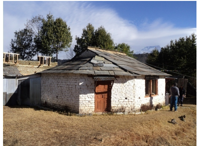
Photo showing the Community lodge for trekkers and visitors

of labor and cash. These community lodge projects are run by the community and profits are passed on to the School development and staff salary. There are three Community lodges in this community trek.