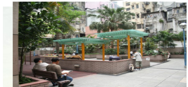
Figure 1. Packet park (Children's play space) [11].